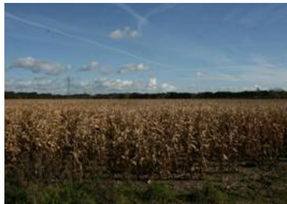
Figure 126: Roeshott fields