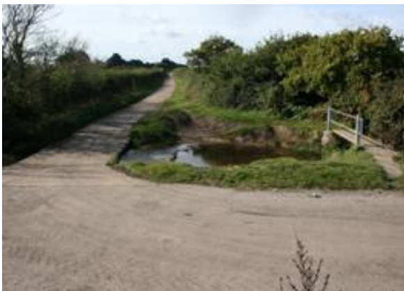
Figure 125: Ambury Lane