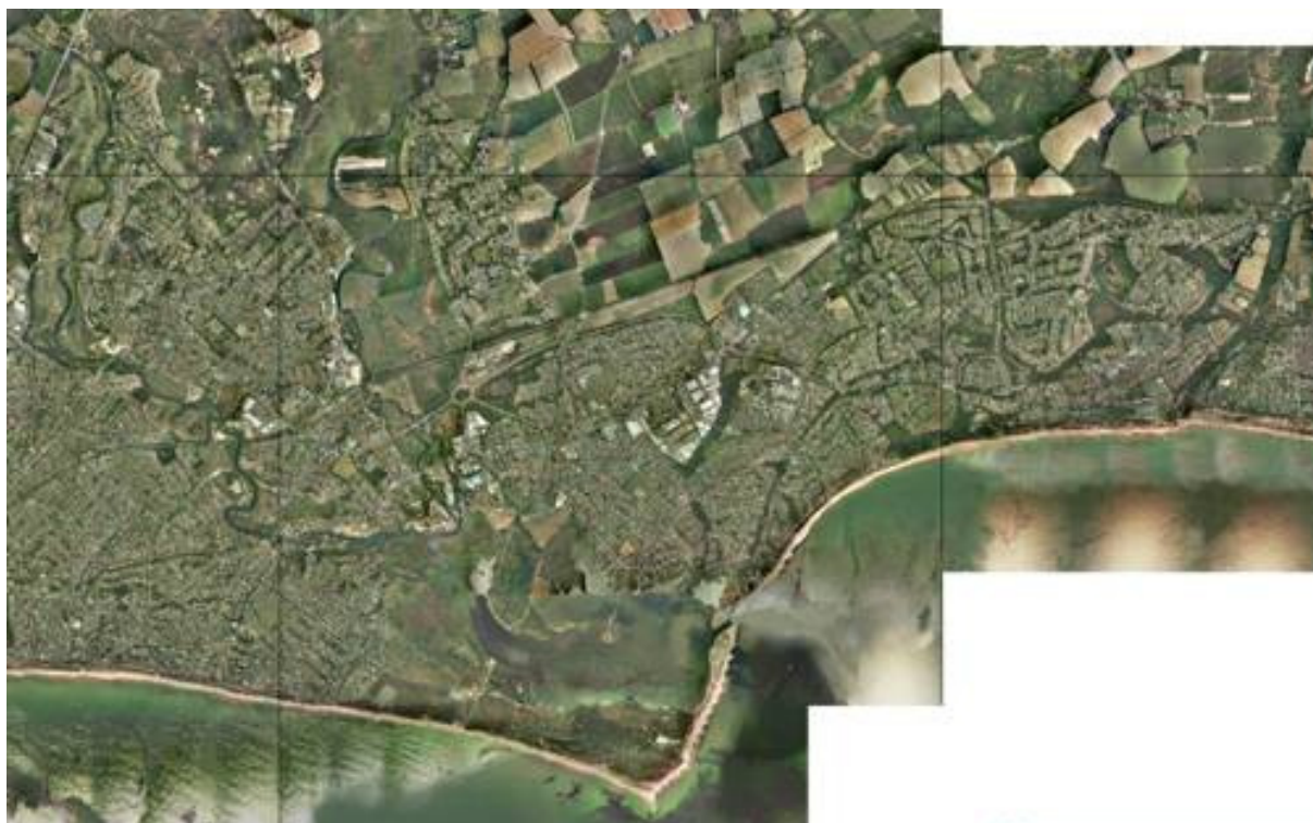
Figure 1: Vertical aerial photographic view of Christchurch, 2005.

cluded on the grounds of the quality of the renovated house and grounds. The hospital and workhouse is a conservation area with important historic buildings as well as depth of social history.