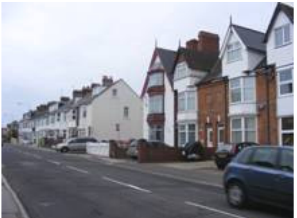
Figure 112: Westham, Abbotsbury Road