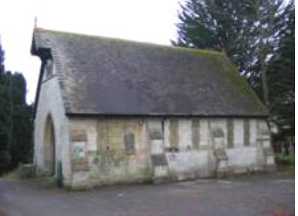
Figure 110: Weymouth Cemetery chapel