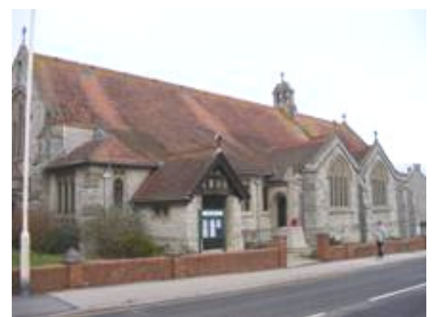
Figure 113: Abbotsbury Road, St Paul's Church

St George's Church, Southill St Paul's Church, Westham Westham and Melcombe Regis cemeteries