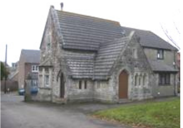
Figure 114: Melcombe Regis Burying Ground, Cemetery Lodge