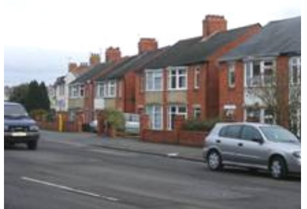
Figure 111: Westham, Abbotsbury Road

There is considerable open space in this area, notably Weymouth Golf Course, but there are also two cemeteries as well as playing fields, the enclose marshland of Chafey's Lake, as well as smaller areas of public open space in the modern housing estates.