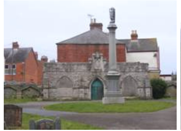
Figure 109: Melcombe Regis Burying ground, memorial