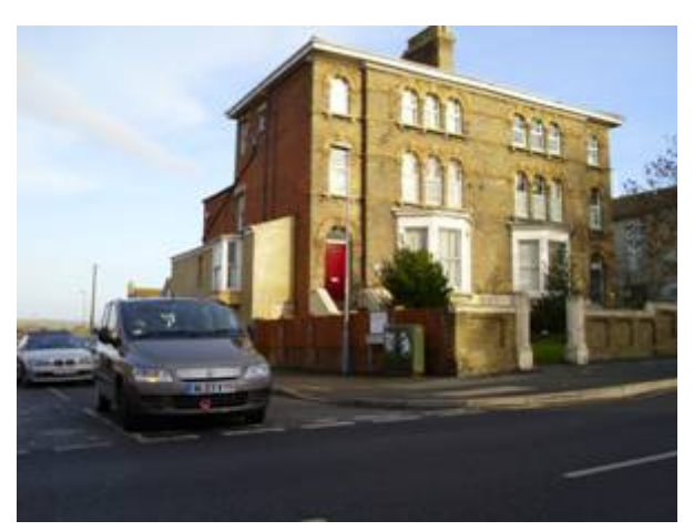
Figure 106: Dorchester Road, Late 19th century villa

This area is almost entirely a 20<sup>th</sup> century development. There were a few late nineteenth century villas built along Dorchester road, but apart from those this area was fields until after 1900.