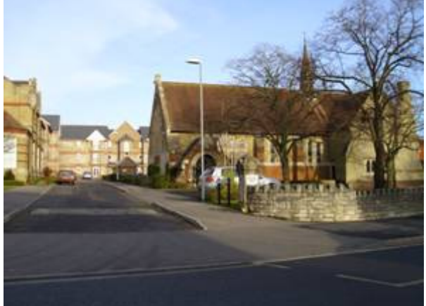
Figure 105: Dorchester Road, former Weymouth Technical College chapel