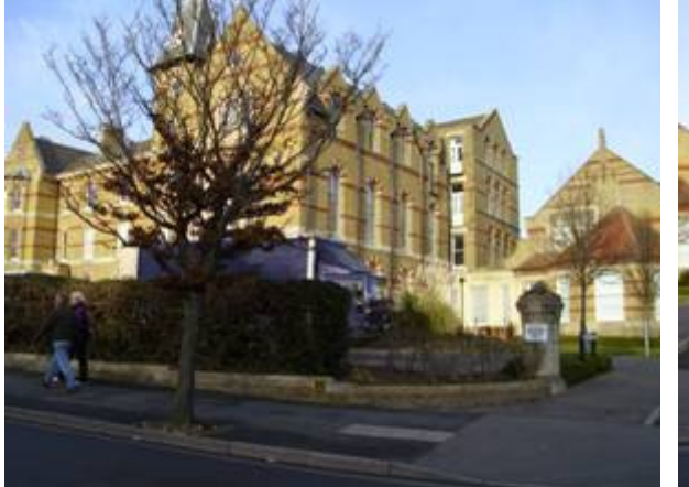
Figure 104: Dorchester Road, former Weymouth Technical College