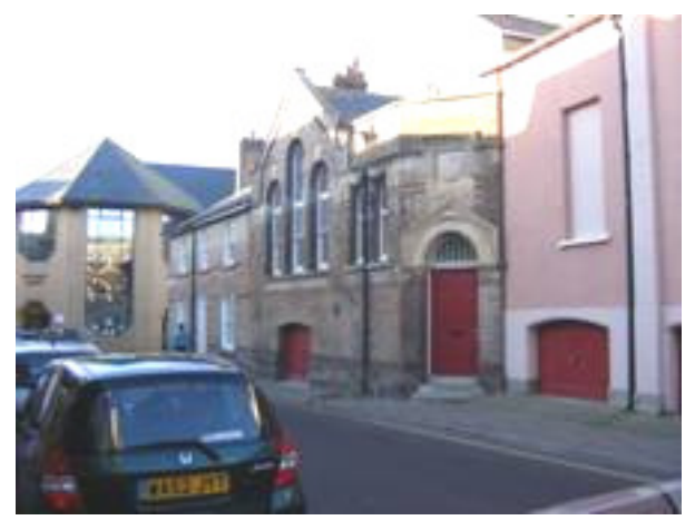
Figure 56: School Street, Masonic hall