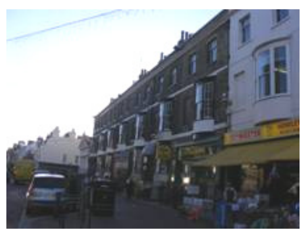
Figure 55: Frederick Place, St Thomas's Street

The settlement pattern consists of high density housing and commercial properties. Housing is only found on the eastern side, closer to Weymouth bay. The central sections of the area, and those parts running alongside the harbour are predominantly commercial. There are virtually no open spaces, the largest being the pedestrian precinct in Bond Street, or green spaces, the only one being the remnants of the cemetery beside St Mary's church.