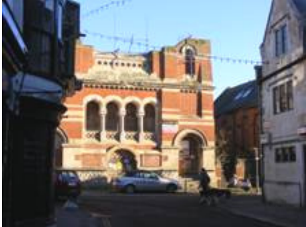
Figure 57: Ruins of Maiden Street Methodist Church