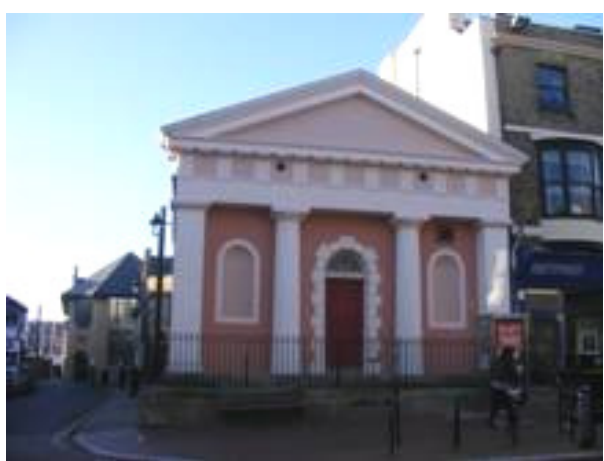
Figure 54: St Thomas's Street former chapel