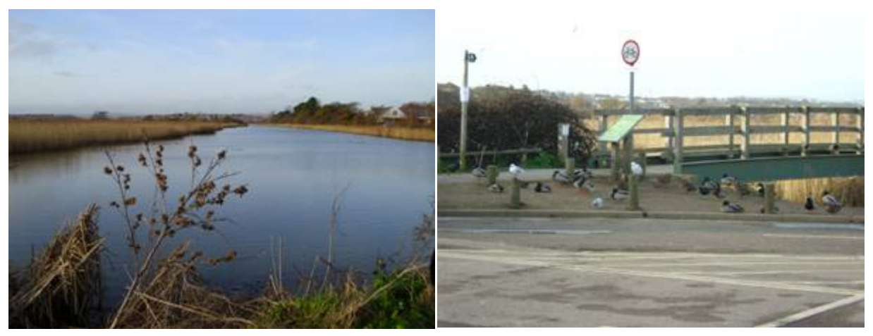
Figure 118: Radipole lake