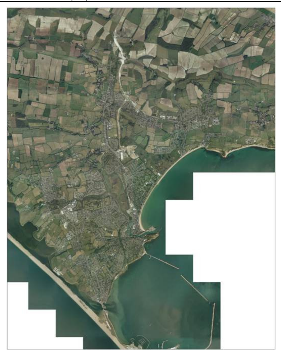
Figure 1 Vertical aerial photographic view of Weymouth, 2005

teenth century when the ports appear in the documentary record, we there earlier settlements and if so where?