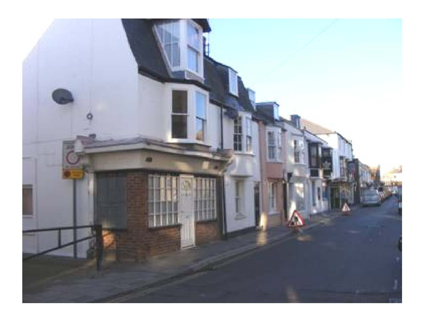
Part 2: Overview of Approach