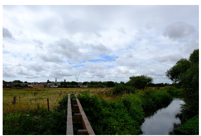
Figure 6.29: All Saints spire – view from the water meadows

View from Ten Hatches Weir on the River Frome to the far eastern end of the site. From here, the spire is now more legible as part of a collection of landmarks that signpost the historic core of the town, including the tower of St Peter, visible to the right of All Saints.