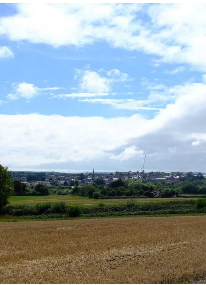
Figure 6.30: View from the Charminster to Stinsford road

The field in the foreground is the part of housing east that ends south of the Charminster to Stinsford road. The spire of All Saints can be seen in the centre of the photograph, and the tower of St Peter's can just be made out to the right of it. See also photographs of St Peter's.