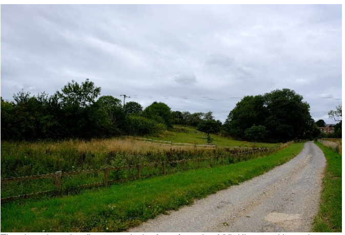
The view along the dive towards the farm from the A35. Kingston House is hidden behind the trees to the right of the photo; the building in the far distance is historic farmworkers cottages. The site is over the brow of the hill to the left of the photograph.