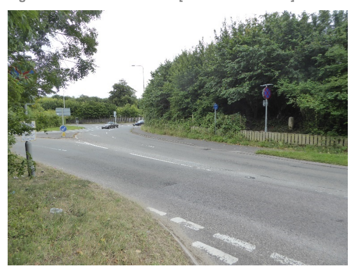
Figure 6.9: Roman milestone [NHLE ref: 1154863]

6.41 In terms of setting, there is limited visibility from the scheduled monument due to vegetation to the immediate north and south, along the present road, meaning it is not possible to see Dorchester. A second much larger section of the Roman road with a dog-leg bend is scheduled further northeast [NHLE ref: 1004562]. However, this scheduled section lies within woodland and so there is no experiential relationship between the two. A Roman milestone [NHLE ref: 1154863] also stands at the A35/B3150 roundabout about 945m southeast of the monument and 90m east of the site (the NHLE spatial marker shows the asset approximately 50m northwest of its correct location). However, this is not its original position as the stone was moved a short distance c. 1866 and again in 1957, and it now stands almost 1m above the level of the modern road.<sup>72</sup> It too has no experiential relationship with the scheduled section of the road by Hollow Hill (or the development site).