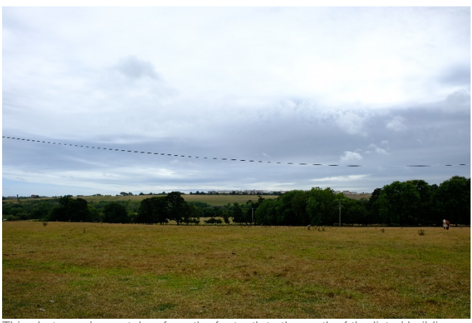
Figure 6.37: View south towards the site

This photograph was taken from the footpath to the north of the listed buildings looking south towards the site. Because of the tree cover and topography, the site is not visible at this point but is beyond the far field in the centre of the photo.