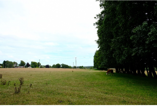
Figure 6.38: View east towards the site

This photograph was taken from the footpath to the north of the listed buildings towards the part of the site to the east of the house (the field around Lower Burton Farm).