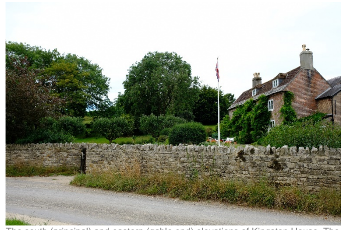
The south (principal) and eastern (gable end) elevations of Kingston House. The gardens of the house can be seen rising up behind it and the site begins at the crest of the incline.