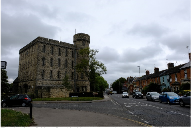
The view from Bridport Road looking east towards the town centre. The more impressive, principal elevation faces towards the town, and we can see the plainer rear façade, which would have faced into the barracks site, to the left.