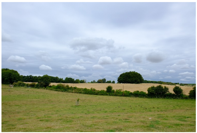
View north-west from Kingston Maurward RPG showing the heavily planted boundary of Birkin House grounds in the far distance.