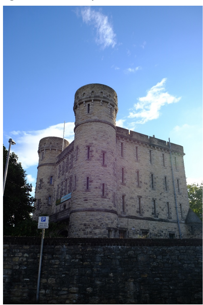
The principal (south east) elevation to the left, framed by corner turrets, and one of its side elevations.