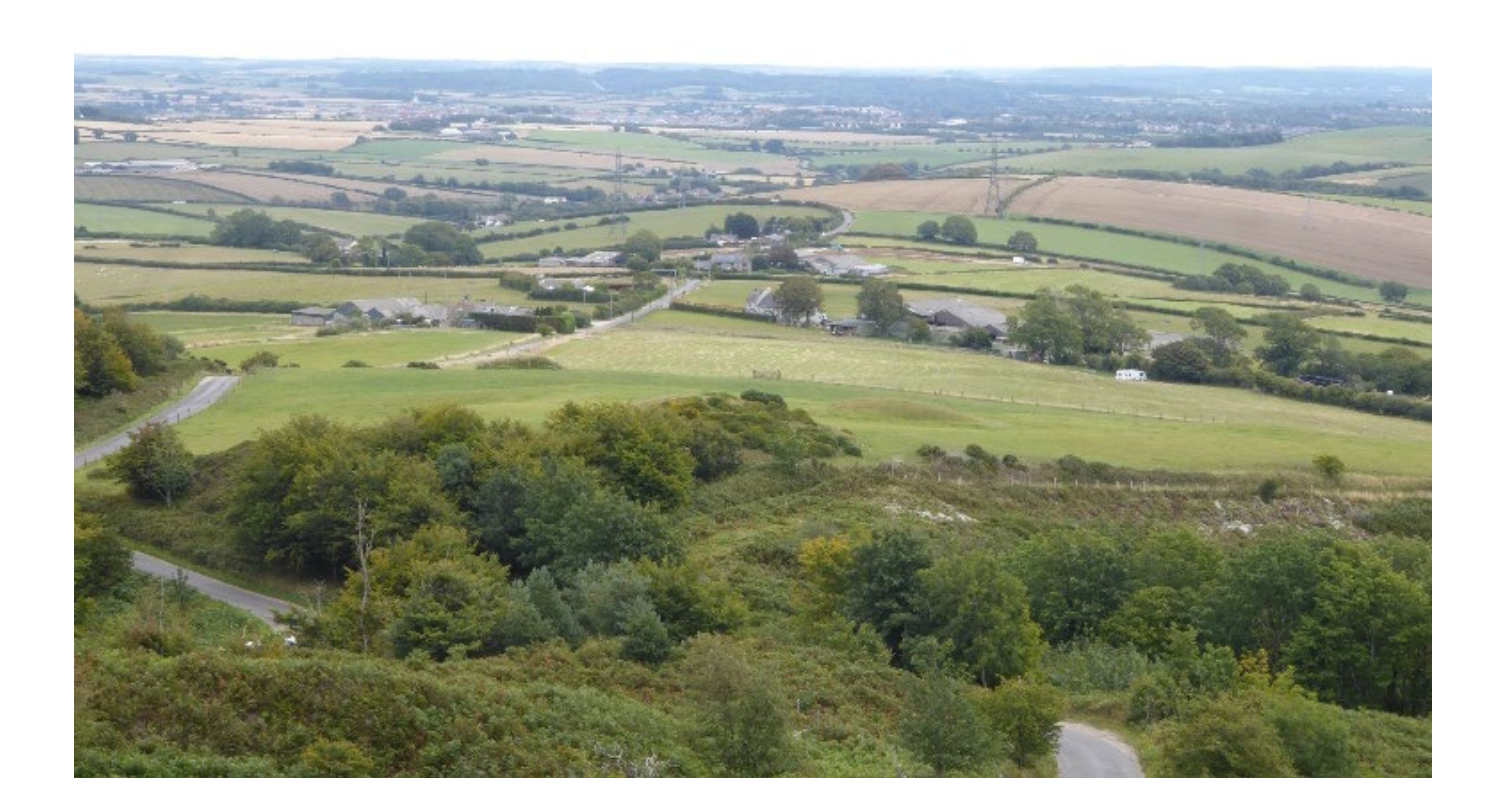
Figure 6.22: View northeast towards Poundbury, Dorchester and the site from the Hardy Monument

The monument can just be made out on the horizon in the far distance, behind and to the left of the chimney of the county hospital (centre of the photo)