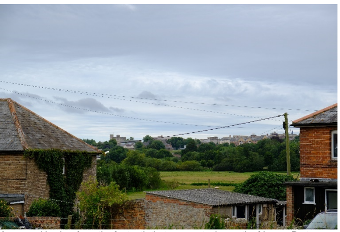
A zoomed in view from the footpath that passes to the north of Lower Burton. The turrets of the building can be seen reaching above the roofline of the town to the left. Because the turrets only frame the principal elevation, it is clear to read even from this point that we are looking at the rear of the building as it faces the town.