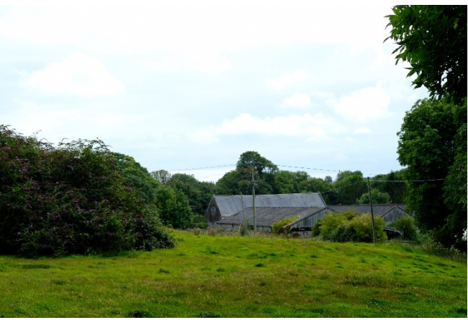
Figure 6.35: The grade II* listed Riding House

View of the Riding House looking southwest from a public footpath to the northeast; the gable end and pitched roof can be seen above later buildings. In the foreground part of the earthworks of the DMV can just be made out.