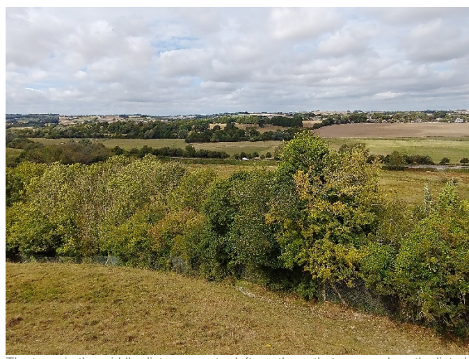
Figure 6.36: View of Wolfeton looking northwest from Poundbury

The trees in the middle-distance centre-left are those that now enclose the listed buildings; the field adjacent to them to the far left is part of the site proposed to remain as open space. The path of the Link Road goes through this field but at a point beyond the edge of this photo.