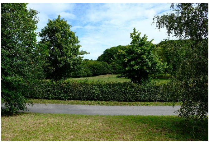
This photograph was taken from the central entrance to the farmhouse. The trees in the middle distance are part of the southern shelterbelt of Birkin House and those lining Hollow Hill, beyond which are the cottages, then the A35 and then the site.