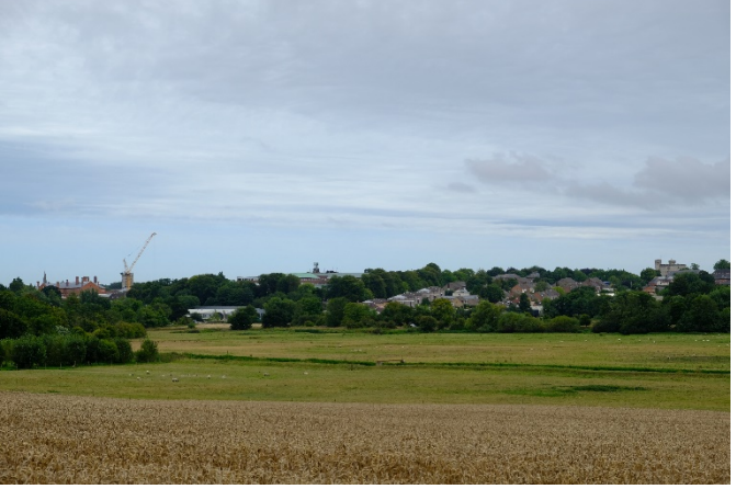
This is a telephoto view of the town taken from the footpath between Wolfeton House and Lower Burton Farm. The tower of St Peter's is visible behind the crane to the far left of the photograph (as is the spire of All Saints). The architectural interest of the building cannot be appreciated at this distance, but the scale of the tower is appreciable. See also photographs for All Saints.