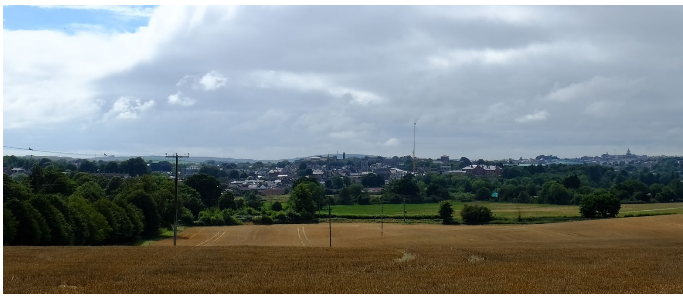
Figure 6.21: View of the Hardy Monument from the Stinsford To Charminster Road

The monument can just be made out on the horizon in the far distance, behind and to the left of the chimney of the county hospital (centre of the photo)