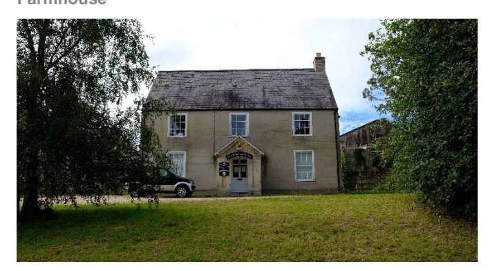
Figure 6.33: Principal (north) elevation of Stinsford Farmhouse

6.202 The proposed development site is located approximately 0.3km to the west of the building, beyond the A35. The Tithe map indicates that in the mid-19<sup>th</sup> century the landholding of the farm included most of the land in the eastern part of the site, up to Slyer's Lane and Higher Kingston Farm, including 'Eweleaze Barn'; however, the historical and functional relationship between the farm and the land within the site cannot be appreciated visually at ground level due to intervening vegetation and the A35, although there may be some views of the site from the upper floor of the farmhouse.