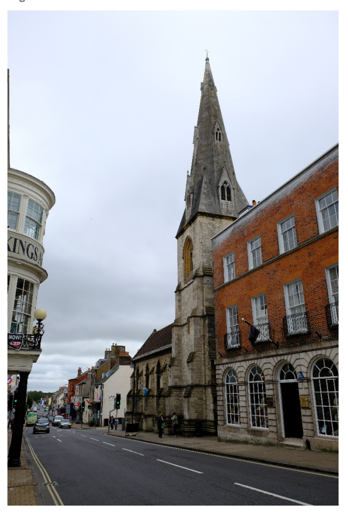
Figure 6.27: The north elevation and tower of All Saints

6.119 Further back into the site and from higher ground, the spire of the church starts to come into view and becomes a defining, although not permanent, feature of the roofscape of the town, visible from various points within the site.