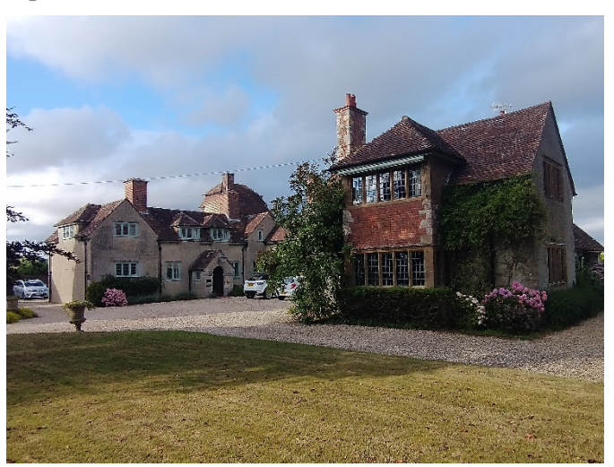
Figure 6.23: Little Court viewed from the southwest

6.108 The house and grounds are 100m east and north of Open Space South and approximately 180m east of Housing West, with the Local Centre another 200m east beyond that.