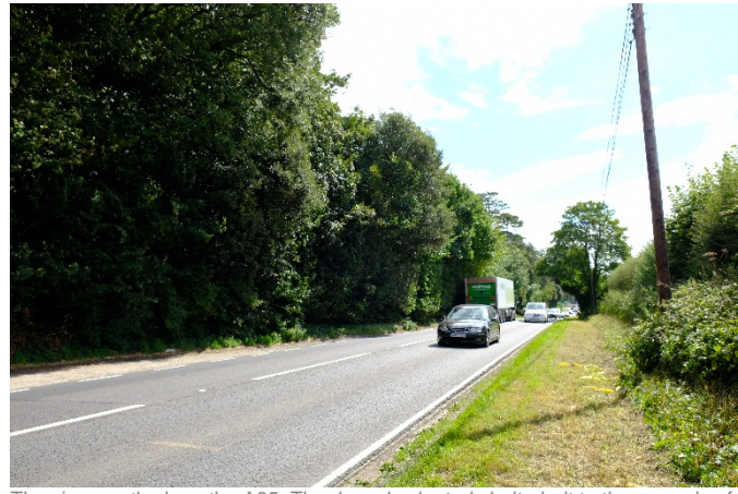
The view south along the A35. The densely planted shelterbelt to the grounds of Birkin House are to the left of the photograph; the site is beyond the tall hedge to the right.