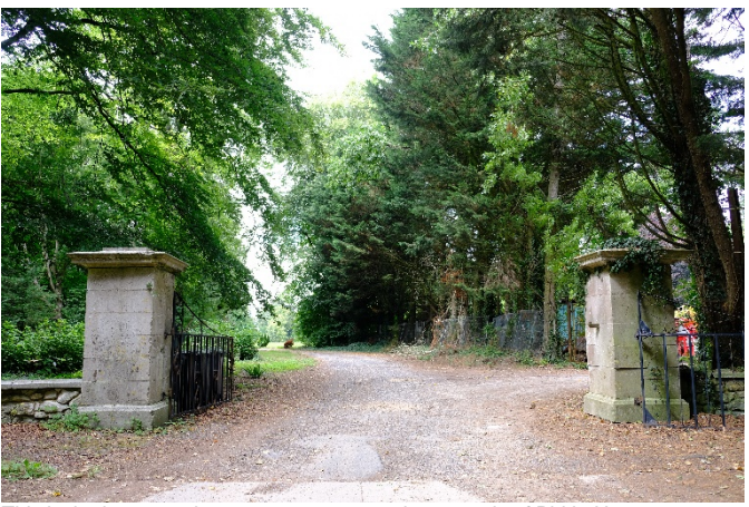
This is the later, south-eastern entrance to the grounds of Birkin House, although it is possible that the gate piers of those of the original entrance onto the A35