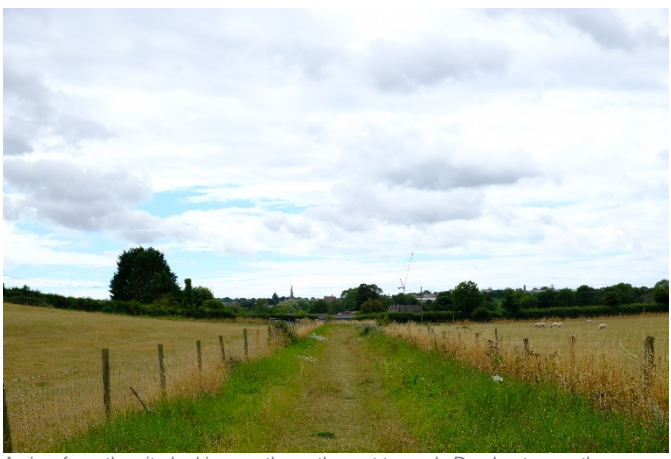
Figure 6.28: All Saints spire

A view from the site looking south-south-west towards Dorchester, on the footpath through the site north of Slyer's Lane leading towards Coker's Frome Farm. The spire of All Saints is the first visually distinguishable and identifiable built historic feature in the landscape from this far out – approximately 1.2km from the asset. The indicative masterplan shows the boundaries for housing east and west areas in the fields either side of this footpath.