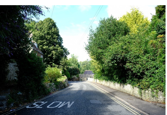
View north down Glyde Path Hill toward the northern boundary.