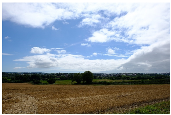
View towards the town from the Charminster to Stinsford road that runs east to west across the site. In these medium-range views the form of the town starts to become more legible and individual features can start to be picked out.