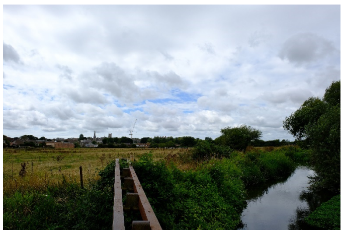
View from the east across the site and water meadows towards the town.