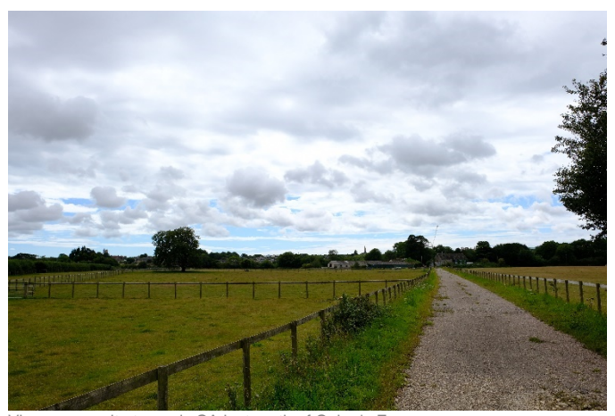
View across site towards CA just north of Coker's Farm.