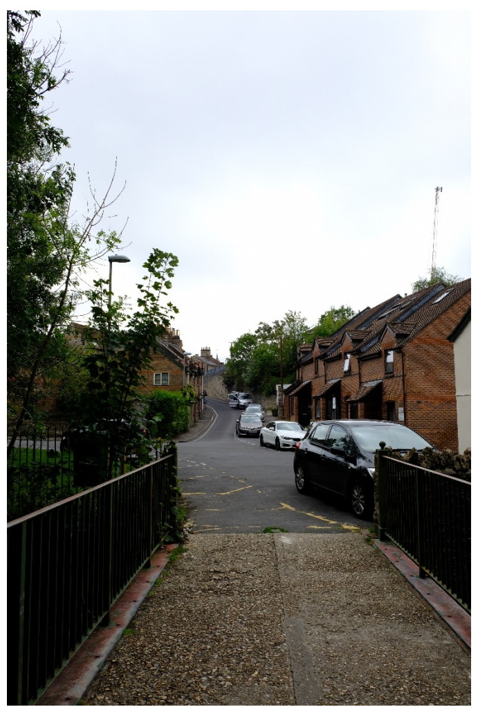
View south up Friary Hill south towards the historic core of the conservation area from the northern extent of the CA.