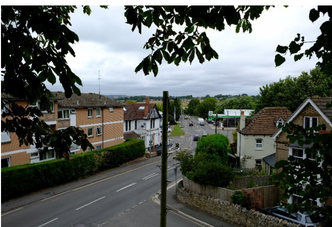
View north northwest from the corner of North Walk and Colliton Walk towards the site.