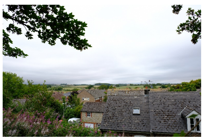
View towards the site from the churchyard of St George's.