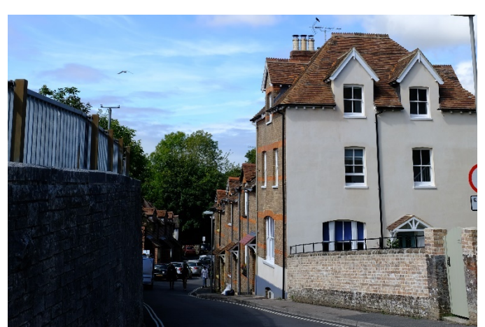
View north down Friary Hill toward the northern boundary.