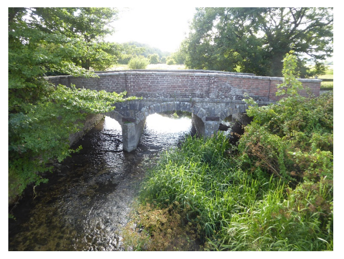
Figure 4.8: Listed bridge NHLE ref: 1324446 looking west (towards the proposed Link Road)