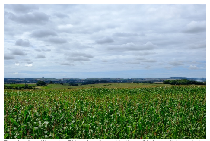
The view from Waterston Ridge. A settlement is discernible in the distance, but what form, features, character or appearance it takes is not clear at this distance, only the rurality of its location.