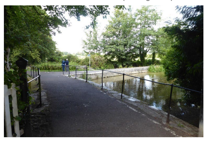
Figure 4.14: View of Johns pond and the listed sluice with the water meadows visible behind (looking north)