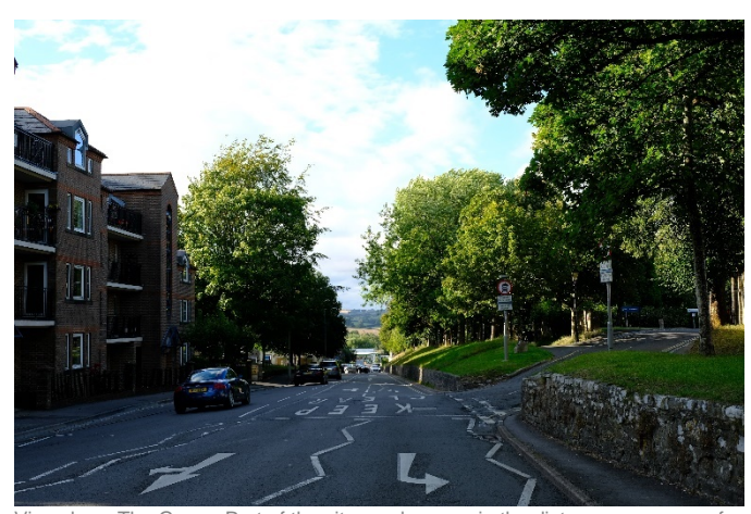
View down The Grove. Part of the site can be seen in the distance – an area of open space on the indicative masterplan.