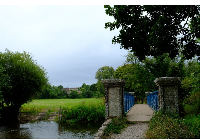
View across the site back towards the CA and wooded northern boundary.