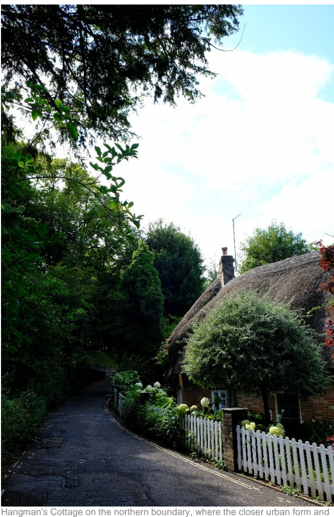
Hangman's Cottage on the northern boundary, where the closer urban form and bustle of the town gives way to its rural surroundings.