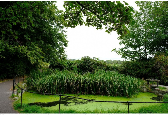
Views towards the site from the northern boundary of the conservation area.