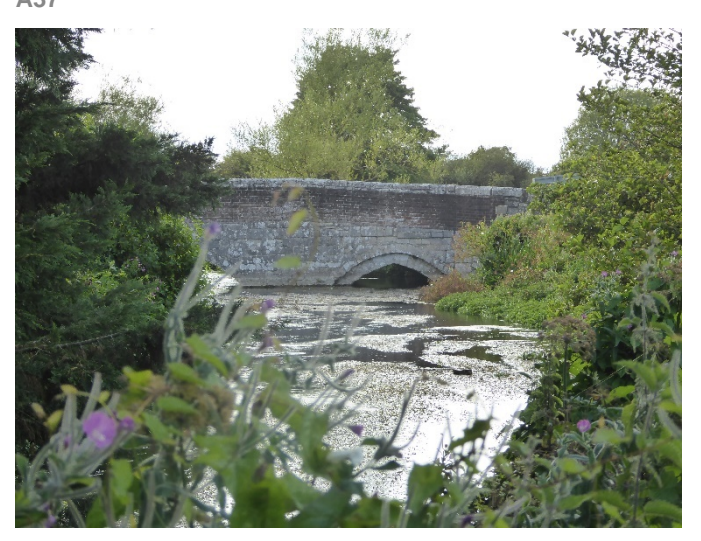
Figure 4.20: Eastern face of Bridge over River Frome on A37

4.92 The B3147 bridge is of later date. Neither it, nor the road it carries, is shown on the draft OS map of 1805, so it is probably mid- 19th century. Constructed of brown brick it has two segmental arches including Portland ashlar voussoirs and a keystone, between which there is a circular cutwater. Above