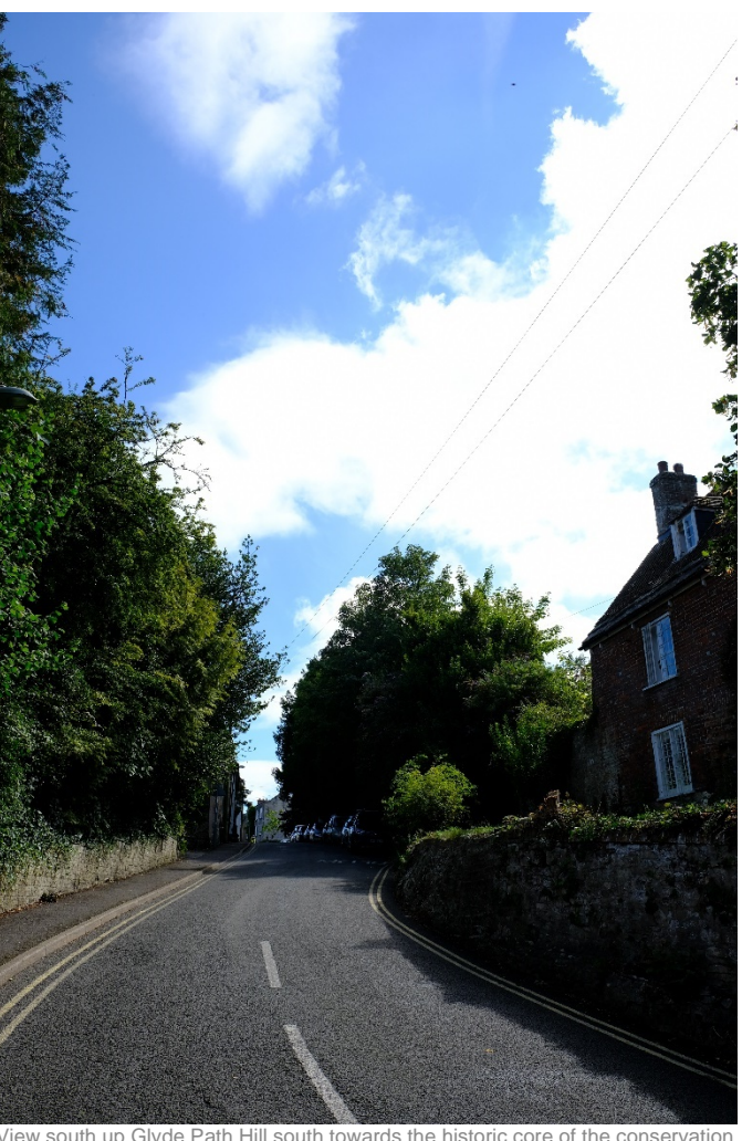
View south up Glyde Path Hill south towards the historic core of the conservation area from the northern extent of the CA.