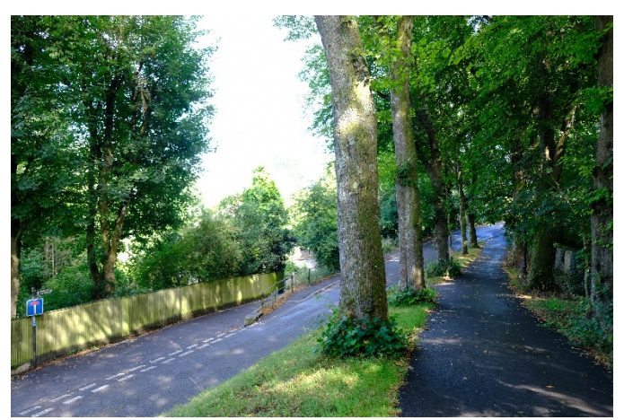
View east along North Walk. Northernhay and Caters Place can be seen set down from the walks to the left-hand side of the photo, and the site lies beyond that (not visible in this view),