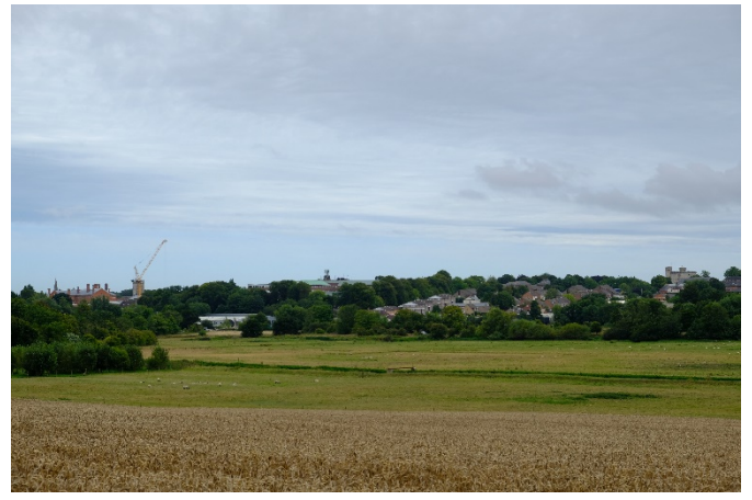
View towards Dorchester CA from the footpath between Wolfeton House and Lower Burton Farm. The fields and water meadows in the foreground form part of the site, proposed on the indicative masterplan to remain as open space, although the Link Road is proposed to run through the field around the farm.