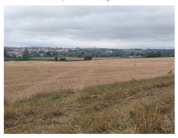
Figure 4.5: View from the site (the eastern end of the Stinsford to Charminster road) looking southwest towards Dorchester, and Poundbury