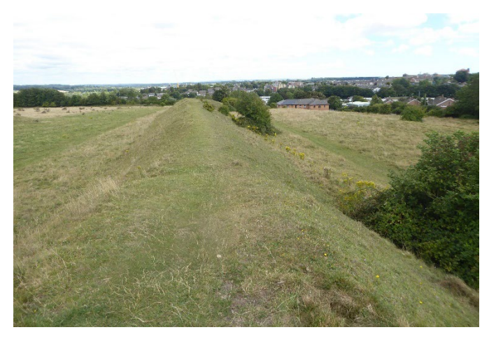
Figure 4.3: View from Poundbury Camp east towards Dorchester