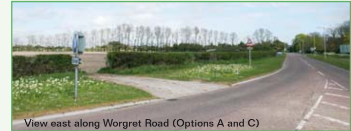
View east along Worgret Road (Options A and C)

For your information, Purbeck District Council and Wareham Town Council are working towards retaining a level crossing across the railway line in North Wareham.