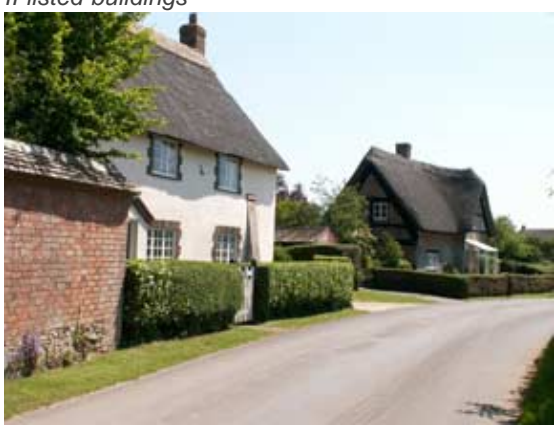
School Cottage & No.198 West Street, both Grade Il listed buildings

Crabb Cottage in Church Street is of similar age. It comprises a single-storey cottage with attics, with walls of stone, brick and cob under a thatched roof. The simple form of this small cottage and the textural quality of its ancient walls are of particular note. Behind, a small thatched cart-shed has been incorporated into the cottage. At the southern end of High Street, facing almost opposite, are two 17th cob and thatched cottages. Both are single storey with attics. That on the west side (202) faced in brick stands immediately onto the edge of the highway, with a small plain brick and tile extension on the north side. The cottage has a distinct thickly layered thatched roof with low eaves. No.200, standing in a small front garden enclosed by hedging, has a rendered front with a thatched porch.