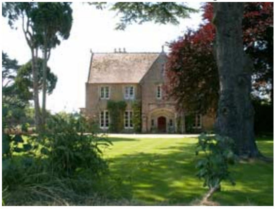
Bishop's Court, a Grade II listed building

There are some notable unlisted buildings which, because of their age, style and character, make a significant contribution to the Conservation Area.