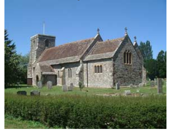
The Church of St Bartholomew, which is of national importance (Grade I), dates in part from the 12th Century; the nave and squat tower

Parish Church of St. Bartholomew, Church Street, a Grade I listed building