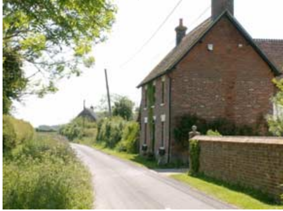
Swallows Nest, Piccadilly Lane

The Anchor Public House stands hard against the corner of High Street and West Street. The present building dates from about 1920, although an inn by the same name has remained on the site since before 1773.