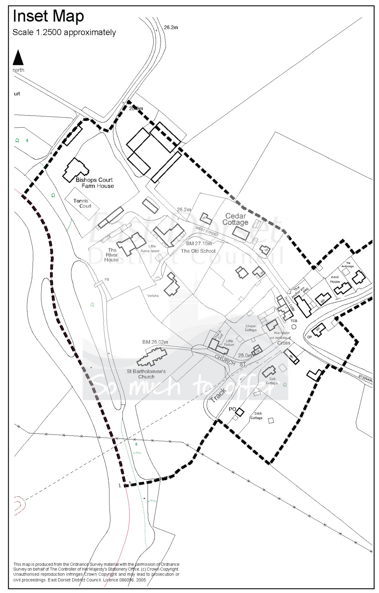
East Dorset District Council Policy Planning Division Supplementary Planning Guidance No. 12 (April 2006,