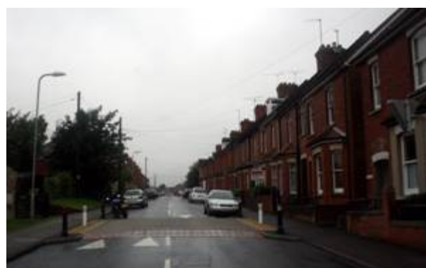
Figure 174: View north along Wootton Grove