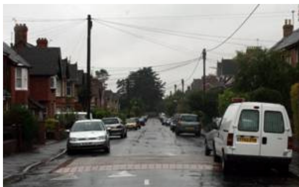
Figure 178: View west along King's Road

No Scheduled Monuments lie within the Character Area.