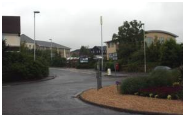
Figure 173: Coldharbour Business Park

Modern buildings: Gryphon School, Sherborne Primary School