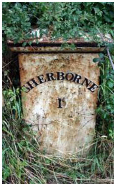
Figure 179: Milestone, Bristol Road