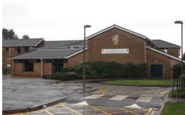
Figure 172: The Gryphon School

The settlement pattern is one of suburban housing arranged around linear and curvilinear culs de sac, though there is some variation within this pattern. The earliest part of the estate around King's Road comprises semi-detached and detached suburban villas and short terraces set back from the street frontage in long rectangular plots on straight roads. The inter-war addition of King's Crescent comprises short terraces set back from an oval close. The estate south of Coldharbour is detached bungalows around curvilinear culs de sac. The McCreery Road area is a typical post-war estate of brick semis with hipped roofs around geometrically designed closes. Late 20 th and early 21 st century estates, fitted in around the earlier core estates, are a mix of small semi-detached houses and short terraces within small plots around linear culs de sac, greens and courtyards (Figure 175).