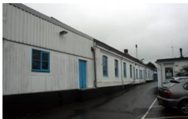
Figure 176: Coldharbour Steam Laundry