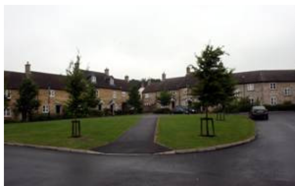
Figure 175: Numbers 83-93 Granville Way