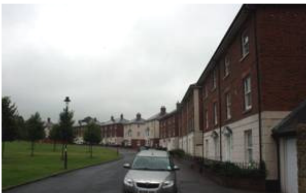
Figure 85: School Drive, Tinney's Lane

64. Sherborne Abbey Primary School. The new Sherborne Abbey primary school was developed on a Greenfield site at the western end of Lenthay Road and opened during 2000. The new buildings are constructed from red brick and other modern materials.