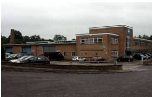
Figure 79: Baumann Springs, East Mill Lane