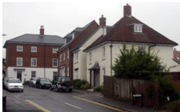
Figure 84: Fairfield Heights, Coldharbour.