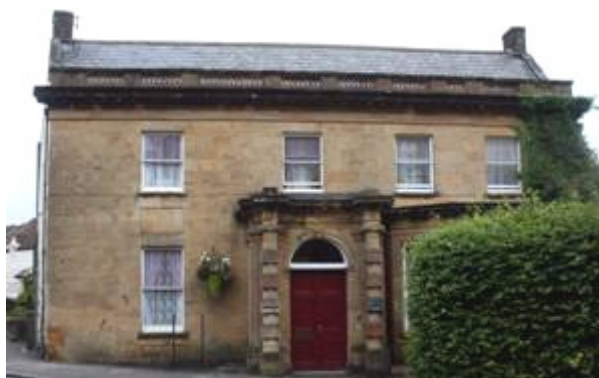
Figure 81: Ludbourne House, South Street

18. Newland Gardens. Newland Gardens was created on the site of the former Newland mar-