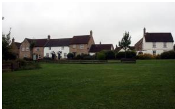
Figure 86: Lamb's Field Housing Estate, Coldharbour