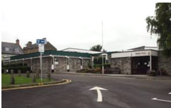
Figure 78: Digby Hall and Library, Hound Street

The historic character of Sherborne is of such significance and quality that the town is now a significant tourist destination. This has an important impact on the trade with 72% of visitors making linked visits to the town. This is now an integral part of the continuing success of the town as a service and retail centre and enables retail trade to thrive within the town in the face