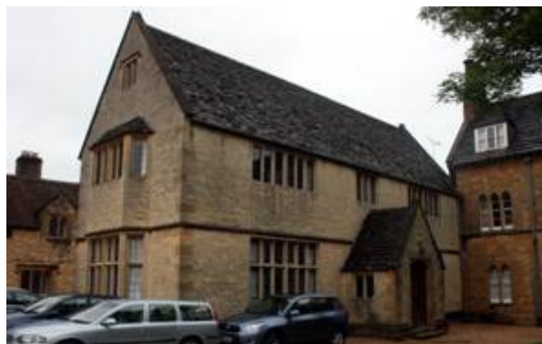
Figure 82: Medlycott Building, Sherborne School