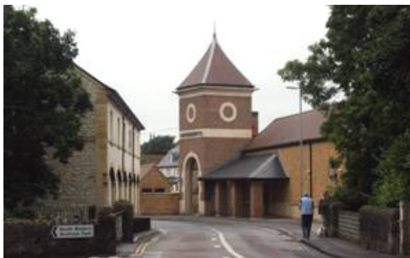
Figure 83: Sainsbury's Supermarket, South Street

32. Sherborne Poor Law Institution . The workhouse buildings were demolished in 1938 (Higginbotham 2008), and an estate of geometrically-arranged short terraces with hipped roofs built at Durrants Close in 1946. Housing ex-