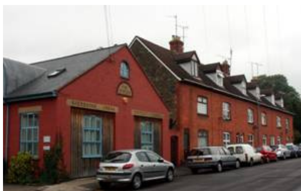
Figure 76: The Old Fire Station and Ludbourne Terrace, Ludbourne Road

54. King's Road Edwardian housing estate . This estate of Edwardian terraces and suburban villas was built around 1910, along with Simon's Road school which was built to serve the needs of the expanding community. Simon's Road and Vernall's Road contain short terraces in red brick with yellow brick window and door arches. The three roads (King's Road, Simons Road and Vernall's Road enclosed a central square