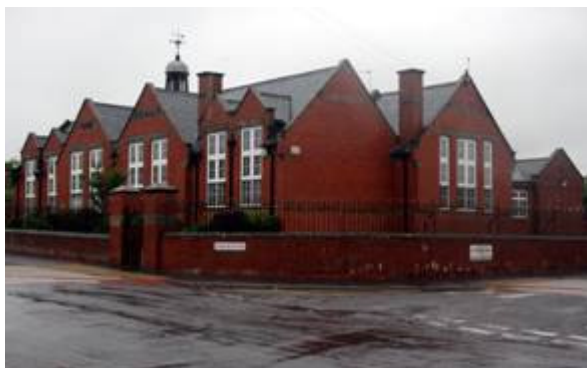
Figure 67: Sherborne Learning Centre; formerly Sherborne Primary School, Simon's Road.

Sherborne continued to expand slowly during the early 20 th century, mainly by the construction of housing estates beyond the limits of the historic town. The most notable example was the Kings Road estates constructed circa 1910, together with Simon's Road School. This was a planned suburban estate outside the northern limits of the town adjacent to the Bristol Road and designed around a grid with a central crescent. Other examples include Priestlands on