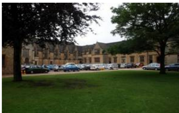
Figure 72: View North West of the Great Court, Sherborne School

19. Eastbury. There was relatively little change during this period.