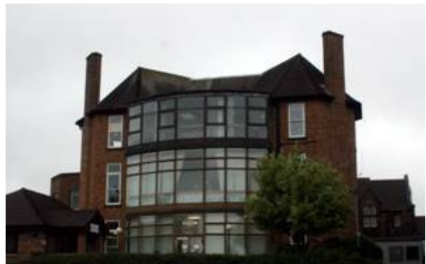
Figure 71: The Yeatman Hospital from the south