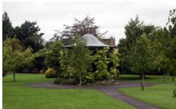
Figure 75: The Bandstand, Pageant Gardens.