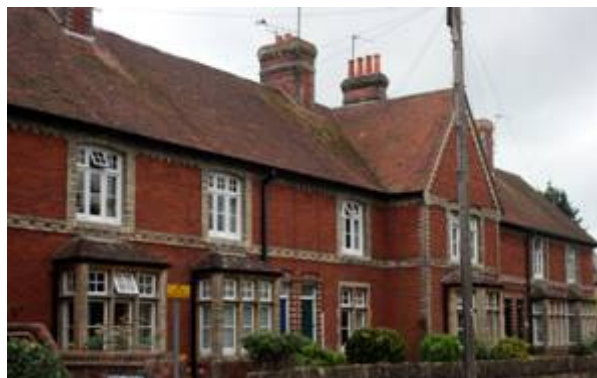
Figure 73: Raleigh Place, Westbury