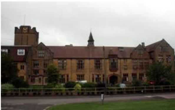
Figure 74: Sherborne School for Girls, Bradford Road

42. Cattle Market. The cattle market continued in use during the early 20 th century with the addition of a new ring, stalls and other buildings.