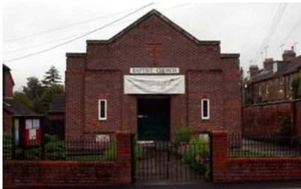
Figure 70: Sherborne Baptist Church, North Road