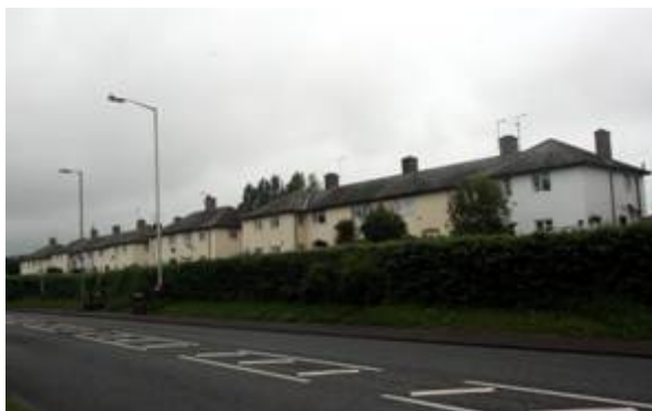
Figure 68: Barton Gardens.