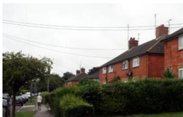
Figure 77: Inter-war housing, Lenthay Road