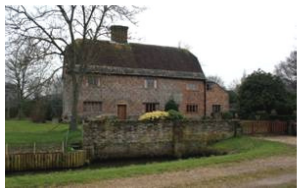
Figure 16: Old Manor Farm, Leigh Common with medieval moat and original entrance in foreground.

The wider road pattern is also likely to have altered during the medieval period, most notably with the major route across Canford Bridge linking Wimborne Minster with the new medieval port at Poole. Bridges were also constructed at Julian's Bridge, Allen Bridge and Walford Bridge. The latter were mentioned by Leland who crossed them on his journey from Poole to Cranborne (Hutchins 1874, 102)