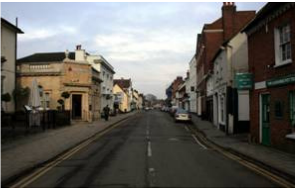
Figure 12: View north along West Borough.