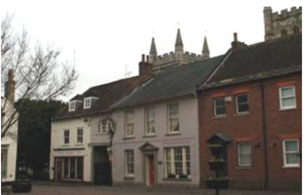
Figure 19: Number 2 Corn Market, formerly the site of the George Inn