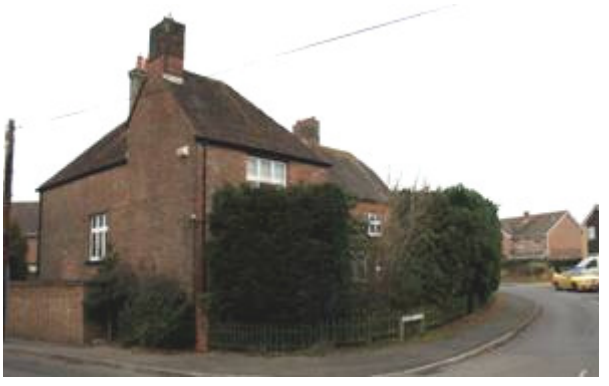
Figure 17: Walford Farmhouse with modern housing estate behind.