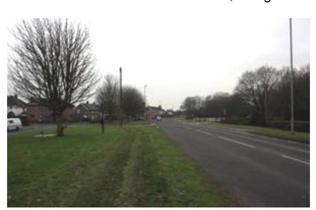
Figure 18: Leigh Common