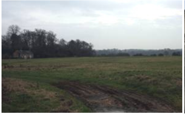
Figure 11: Earthworks in The Leaze, the site of Figure 12: a deserted medieval suburb of Wimborne Minster.

Both manors held separate markets during the medieval period. The Dean's market was first mentioned in Close Rolls dating from the early 13<sup>th</sup> century. In the second year of Henry II (1217-18) the market day was changed from Sunday to Monday. The Sunday market was still being held however, in the 4th year of Edward II (1311-12). In 1224 the sheriff of Dorset proclaimed that the market and fair formerly held within the cemetery of Wimborne should in future be held outside under the walls, on land belonging to the dean on the same days and with the same liberties and customs as formerly. The market may have moved to the Corn Market at this time, or even the Leaze, although by 1413-14 it was recorded that the church of Wimborne Minster held a market in the churchyard. The Lord of the Borough also held a market by 1236 when he complained that his market was being damaged by that of the Dean. It is likely that the Borough market was held in the street of West Borough. Two annual fairs were held in the town on Good Friday and in September, the profits from