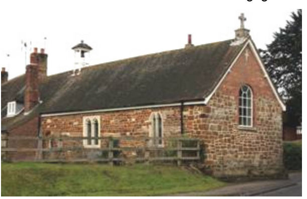
Figure 14: St Margaret's Chapel.

The medieval period saw significant changes to the layout of Wimborne Minster. Chief amongst these were the creation of two new suburbs at The Leaze and The Borough, on to the south and north sides of the town. Both seem to have been planned expansions and took the form of a central straight street lined on both sides with houses and two parallel back lanes to the rear. The Leaze suburb was abandoned during the 14<sup>th</sup> century and now survives only as earthworks. The Borough has a wide central street (West Borough) which also served as a market. The plots seem to have been divided into and held as burgages.