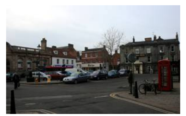
Figure 9: View SW across The Square. Recent excavations have shown that the east end of the chancel of St Peter's Chapel lay approximately in the position of the cycle racks in left centre of the photograph.

2. The Monastery. A nunnery was established by King Ine at Wimborne Minster before AD 705, with his sister Cuthberga as the first Abbess. Shortly afterwards the church was made a double monastery with separate houses of monks and nuns kept strictly apart. This early monastery appears to have been destroyed through Viking raids in the 10<sup>th</sup> or early 11<sup>th</sup> century and was re-founded by Edward the Confessor as a house of secular Canons. The site of a Saxon church is thought to underlie the current Minster church, as indicated by the discovery of a tessellated floor beneath the current church floor (Woodward 1983, 57). Fragments of the early 11<sup>th</sup> century church, probably the original house of secular cannons, survive within the current building. The extent of the monastic precinct remains unknown, although a possible