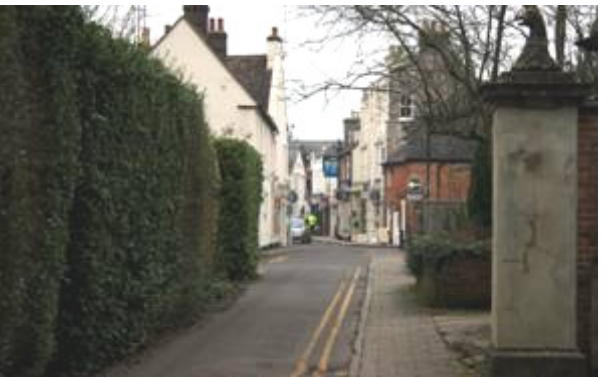
Figure 7: Looking north along the line of Dean's Court Lane and High Street.