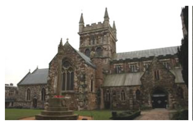
Figure 6: The church of St Cuthberga, showing the Saxon circular turret in the north transept.

Wimborne Minster was not recorded as one of the four Dorset boroughs at the time of Domesday. The tenure of the estate was spread across several holdings, although the main manor was held by King Edward in 1066 and passed to William following the Norman Conquest. This manor paid one night's revenue (together with three other manors at Shapwick, Moor Crichel and Wimborne St Giles). This large estate encompassed the whole of the lower Allen Valley and the north bank of the river Stour between Badbury and Hampreston. It was predominately a pastoral landscape and relatively sparsely populated with 63 villagers, 68 smallholders and 7 cottagers spread across