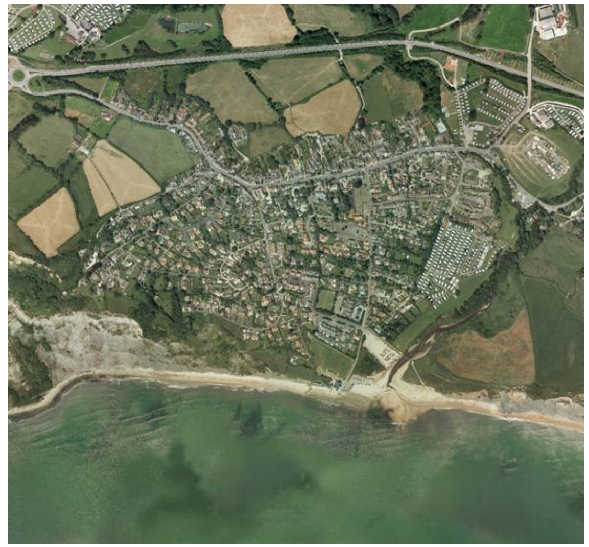
Figure 1: Vertical aerial photographic view of Charmouth, 2005.

The built environment exerts a strong influence on the historic urban character. The frontage of the main street is largely composed of historic buildings with relatively little intrusion from modern development. There is a strong contribution from late Regency and early Victorian houses and cottages throughout the town, punctuated by a number of older houses and cottages which add additional variety and interest to the built environment. The buildings vary in their position to the street, with some set directly on the street frontage and others set back behind front gardens. The topography also exerts a strong influence on the townscape character. The steep climb up through the town with its progression of buildings up the slope has a very different feel to the experience of moving downslope through the town from west, with its many good views over the lower parts of the town and the surrounding countryside. Trees and other green elements provide a very positive element to the urban character, ameliorating the hard urban elements along The Street and linking with the surrounding landscape. This