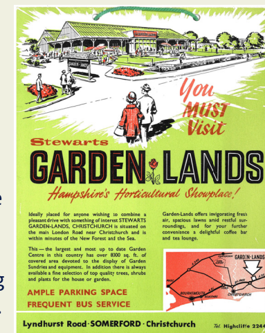
Stewarts of Ferndown archive

It's lovely to have, it gives us a soul. We are very grateful that the superb resources of the History Centre are there; all the team have been an amazing support in caring for our records”.