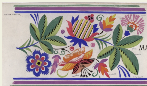
Poole Pottery archive

Through the professional service offered by DHC, businesses can have confidence that their archives will be protected and accessible for generations to come.