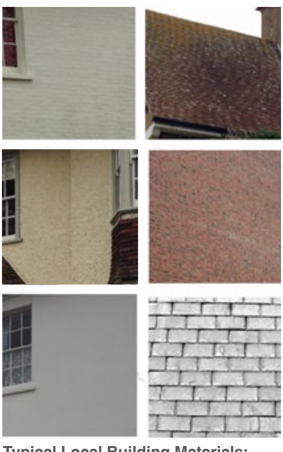
Typical Local Building Materials:

Character Area 2: Housing within this character area will reflect the Mid 19th Century - Early 20th Century architectural styles that are characteristic of Allington, notably West Allington Road, Allington Park and Park Road, a character which can be seen to be more urbanised and planned than in Character Area 1.