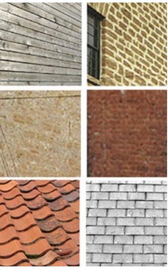
Typical Local Building Materials:

Character Area 4: Employment - The proposals incorporate the provision of employment units to the north-west of the site fronting the B3162 West Road. Some of the units will take the form of converted farm buildings incorporating the local vernacular. The commercial floorspace in the form of small scale rural enterprise will be a variety of sizes set in a total site area of 4 hectares.