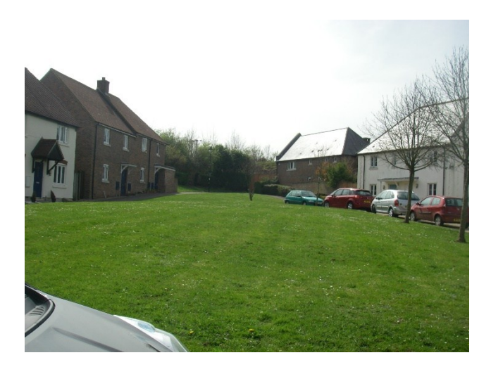
There is a children's play area amongst the 1980s housing.

Areas of housing are interspersed with areas of green space, which for the most part consist of grassed areas and young trees. This gives a feeling of space in an area where the housing is quite dense.