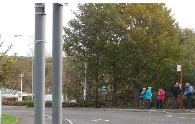
Figure 2-2: Bournemouth Road Bus stop