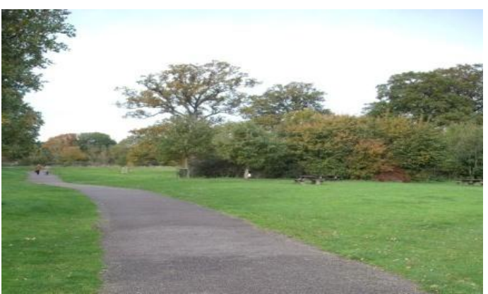
Figure 2-5: Footpath through Langton Meadows to town centre

2.4.4 The footpaths are generally in adequate condition, and the dedicated footway/cycleway through Langton Meadows; apart from the aforementioned lack of lighting, is well maintained and wide enough to support a number of pedestrians and cyclists.