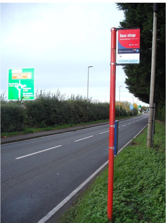
Figure 2-3: A350 Bus stop location