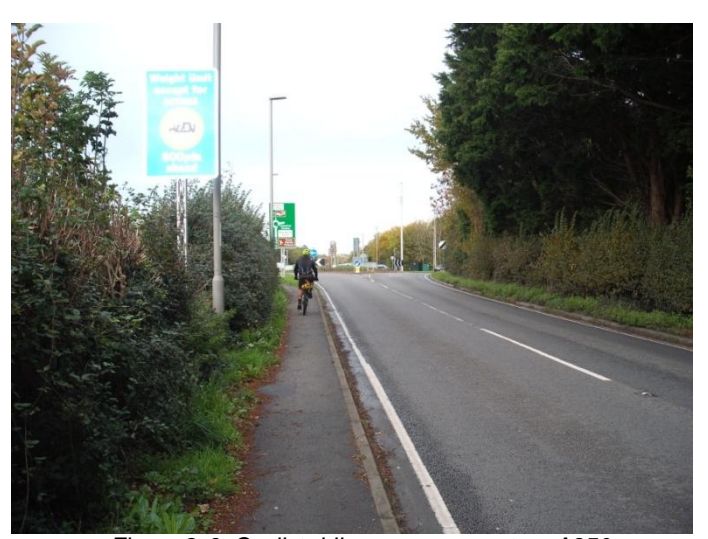
Figure 2-6: Cyclist riding on pavement on A350

2.4.7 Route 253 runs through Langton Meadows, which provides the quickest route to Blandford Forum town centre, but there is no cycle lane here either, despite the footpath through the park being wide enough to support one for the majority of its length. The cycle route through the meadows is marked, as shown in Figure 2-7.