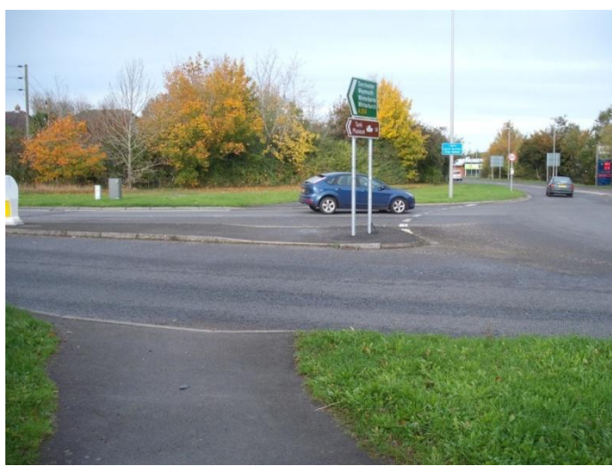
Figure 2-4: Crossing on the A354