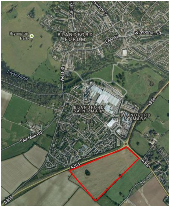
Figure 2-1: Proposed Development within Blandford Forum

2.1.1 The proposed residential development is for 350 dwellings on a 27 acre site bordered by the A354 to the west and the A350 to the north, as shown in Figure 2-1 below. The proposed site is situated on the edge of Blandford St Mary; a village approximately 1 kilometre to the south west of Blandford Forum town.