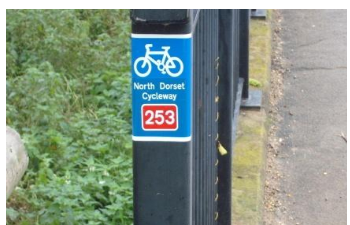
Figure 2-7: Marker in Langton Meadows showing NCN Route 253

2.4.7 Route 253 runs through Langton Meadows, which provides the quickest route to Blandford Forum town centre, but there is no cycle lane here either, despite the footpath through the park being wide enough to support one for the majority of its length. The cycle route through the meadows is marked, as shown in Figure 2-7.