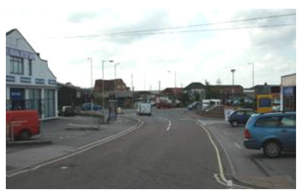
Figure 56: View south along Station Road.

Trees and open green spaces are not dominant in this area, but are most evident along the Stour and along the line of the railway.