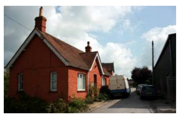
Figure 60: Brickfield House, Brickyard Lane.