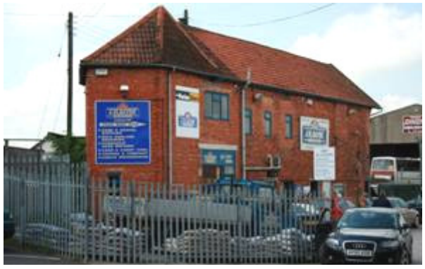
Figure 58: J. H. Rose, last remaining standing building from the 19<sup>th</sup> century bacon factory.