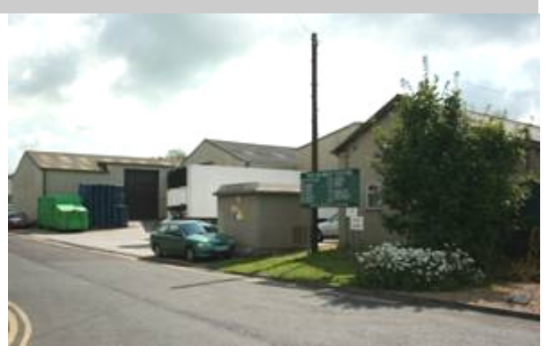
Figure 57: Old Market Centre Industrial Estate, Station Road.

19th century houses: Gordon Villas, New Road