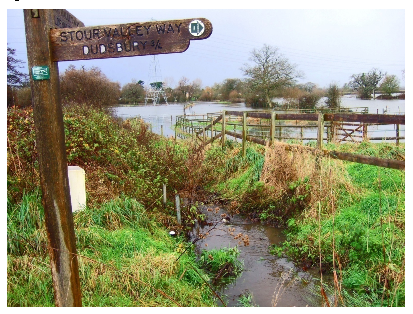
Photo taken from the pavement on the western side of New Road adjacent to the access track to the stables (location indicated on Figure 2).