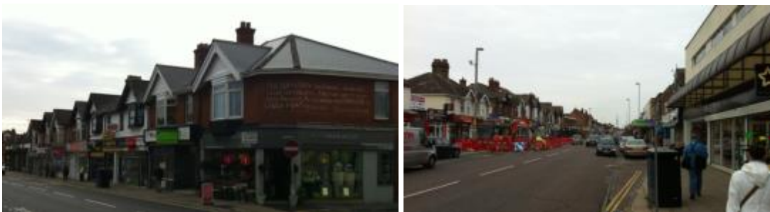
Figure 2.1 and 2.2: Upper Parkstone (Ashley Rd)

3.2.3 The High Street appears to have similar problems with vacant properties as the town centre. For instance, of the eight units directly next to Waitrose (in figure 2.1, opposite St John's church) in what could be considered as a main retailing area on the street, at the time of the survey, four had letting or sale signs. Vacant properties were found in a number of locations along the High Street.