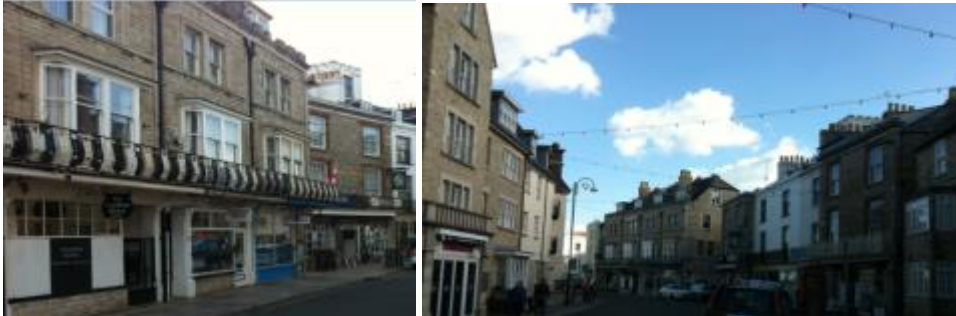
Figure 5.5 and 5.6: Swanage High Street

also due to its design being very different to the surrounding units. The majority of the buildings are of a similar height, and with much of the retail environment facing east towards the bay, creates a pleasant shopping environment.