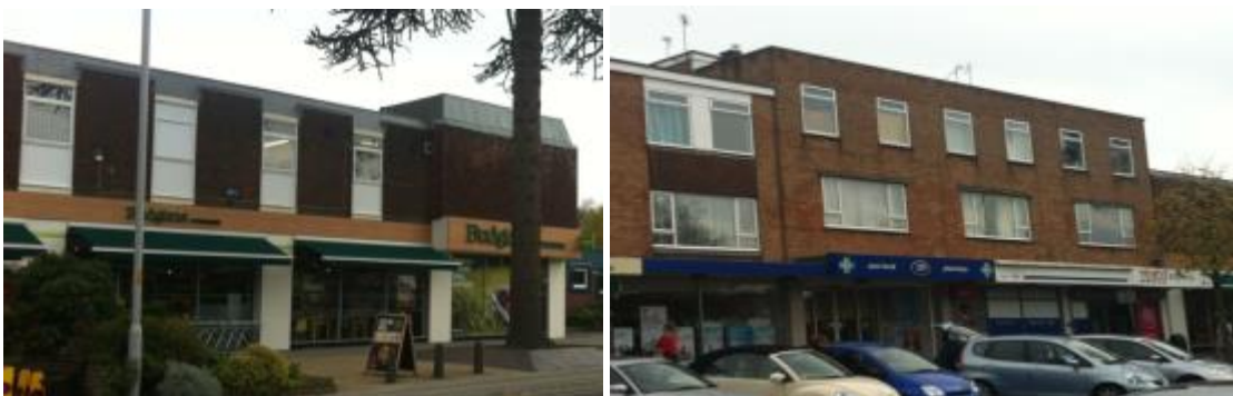
Figure 4.2 and 4.3: Broadstone Town Centre, key convenience retailers