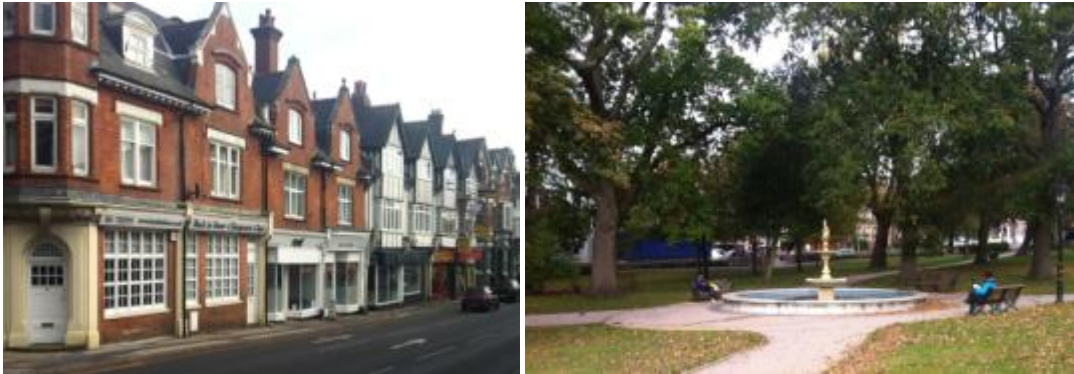
Figure 3.1 Ashley Cross (Commercial Rd) and 3.2 Ashley Cross Green