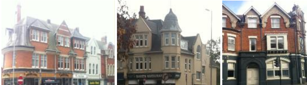
Figure 3.5 and 3.6 Ashley Cross (Station Rd), Figure 3.7 The Ox on Commercial Rd