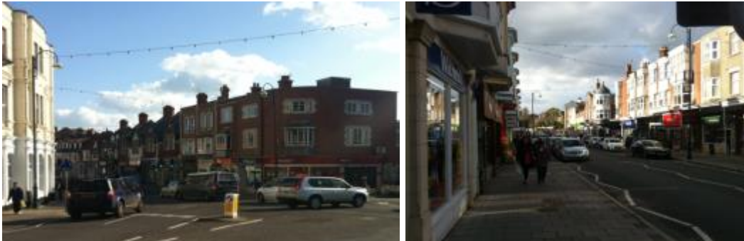
Figure 5.1 and 5.2: Swanage Town Centre, Primary Retail Area