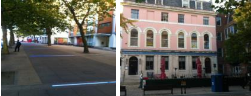
Figure 1.9 and 1.10: Poole High Street (lower section close to the Quay)

2.1.14 The streetscape, as a whole, is greatly improved in this area too. Unlike the rest of the centre, this area appears greener with a number of trees lining the streets, creating a more attractive setting. Pavements throughout this area are considerably better than other areas in the high street, particularly the lighting along the street this street which also provides a more welcoming feel to this area of the town.