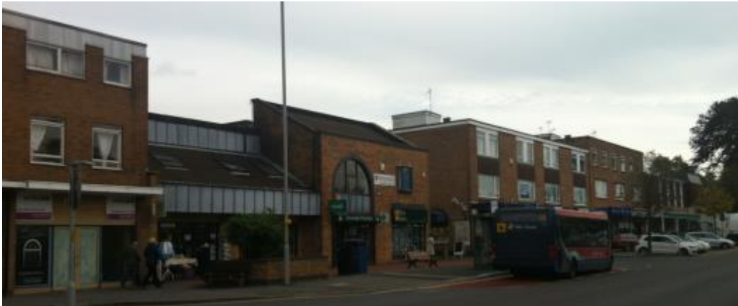
Figure 4.1 Broadstone Town Centre, primary retail street