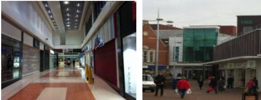
Figure 1.2 and 1.3: Dolphin Centre, Poole