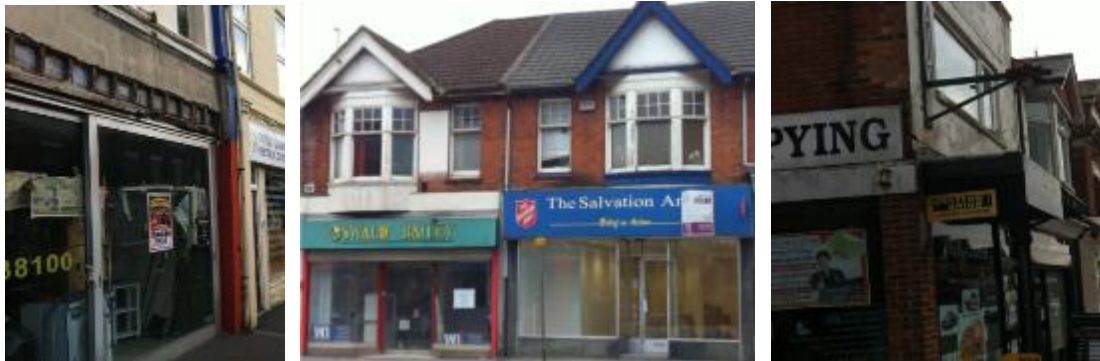
Figure 2.3, 2.4 and 2.5: Upper Parkstone (Ashley Rd)

fronts appearing rather tired. The western side of the High Street is in on the whole in a poorer state than the eastern side.