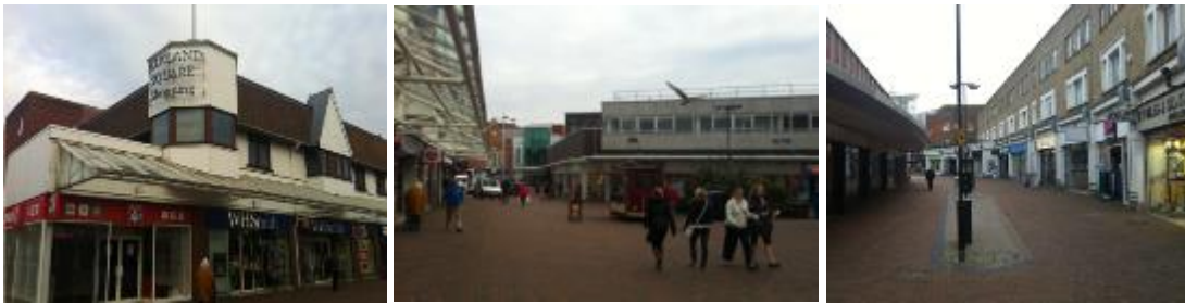
Figure 1.4, 1.5 Falkland Square, and 1.6 Kingsland Crescent