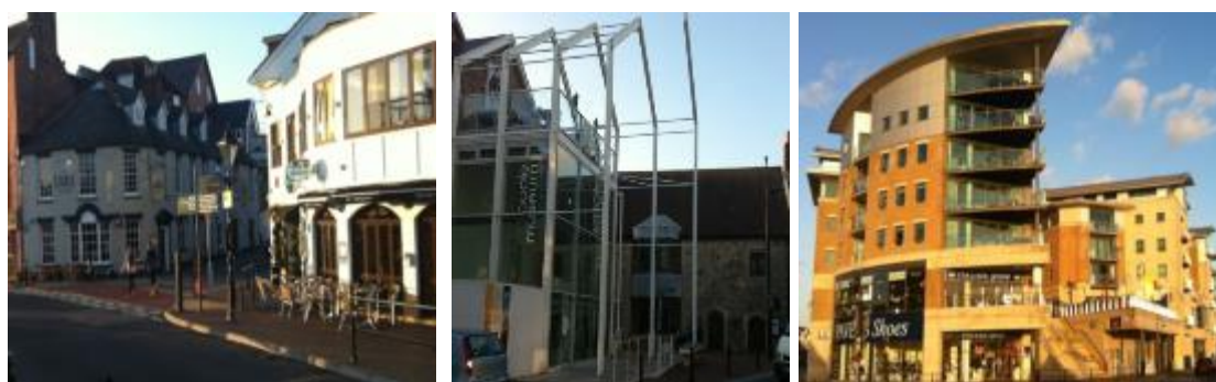
Figure 1.13, Poole Quay, 1.14 Poole Museum and 1.15 Dolphin Quay