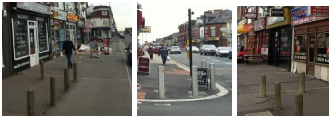
Figure 2.6, 2.7 and 2.8: Upper Parkstone (Ashley Rd)