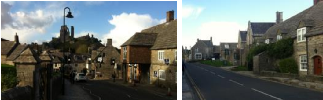
Figure 7.1 and 7.2 Corfe retail environment