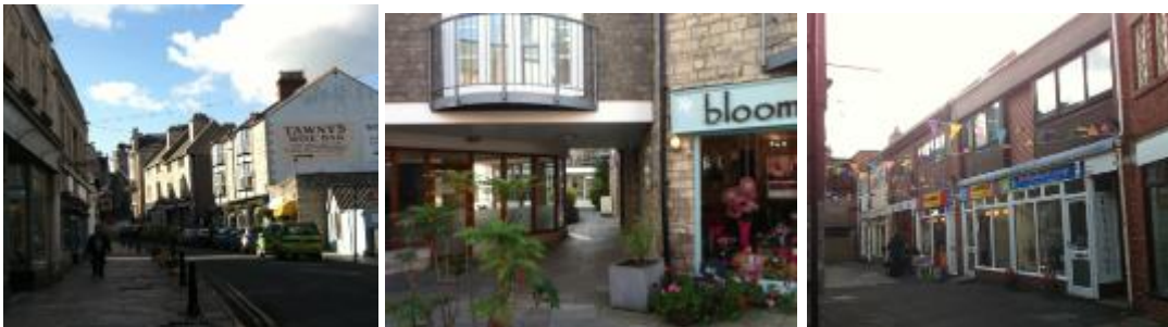
Figure 5.7 Swanage High Street (upper section) 5.8: Emporium Shopping Arcade and 5.9 Commercial Road