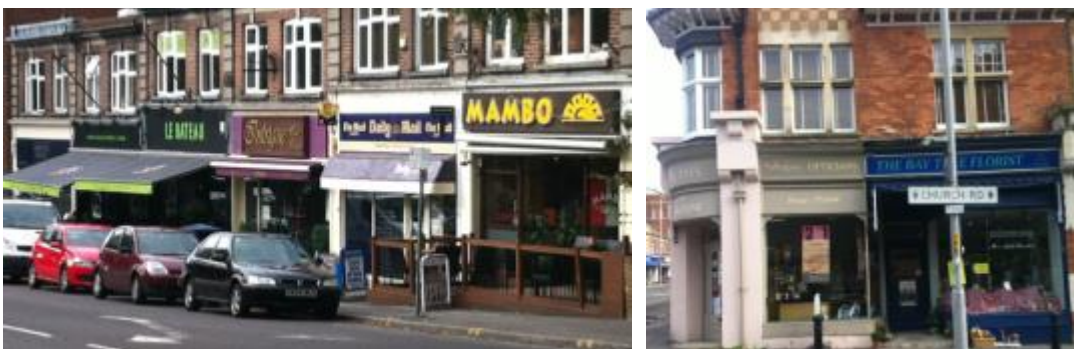
Figure 3.3 Ashley Cross (Commercial Rd) and 3.4 Ashley Cross (Church Rd)