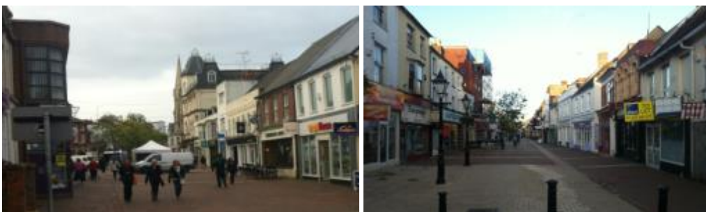
Figure 1.7 and 1.8: Poole High Street