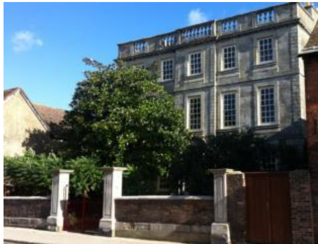
Figure 6.1 and 6.2 Wareham High Street

The streets are well maintained and there are very few signs of derelict properties. The urban environment also appeared relatively green, with a number of hanging baskets and planting areas throughout many of the streets and side streets.