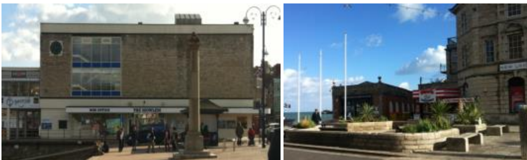
Figure 5.3 The Mowlem Centre and 5.4: Swanage High Street