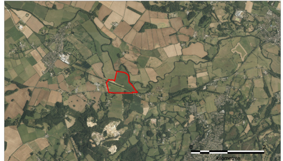
AS14- Henbury Farm - Aerial view