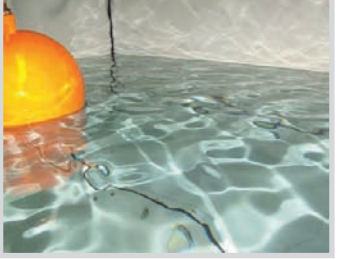
Asbestos Fire Legionella Radon