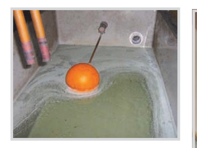
keeping you safe from .....

"Thank you Dorset Property for the continued support in co-ordinating H&S issues around DCC properties"