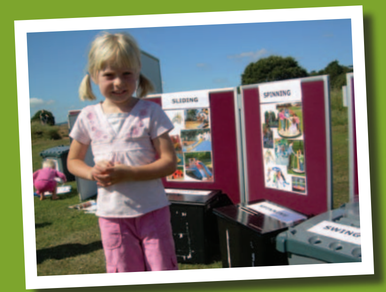
Section 106 £383,000 - let the people decide