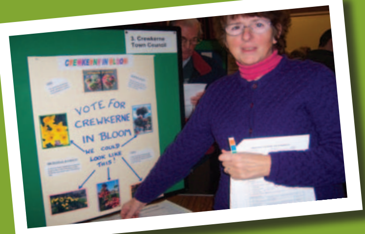
Crewkerne resident votes