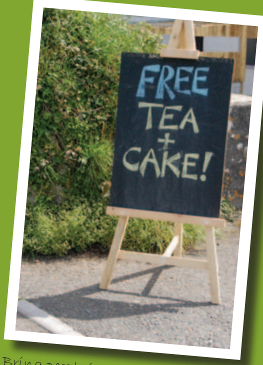
Bring people in

For support in planning and delivering PB contact: lesliesilverlock@groupswork.com 07831 711380 or The Participatory Budgeting Unit: http://www.participatorybudgeting.org.uk/