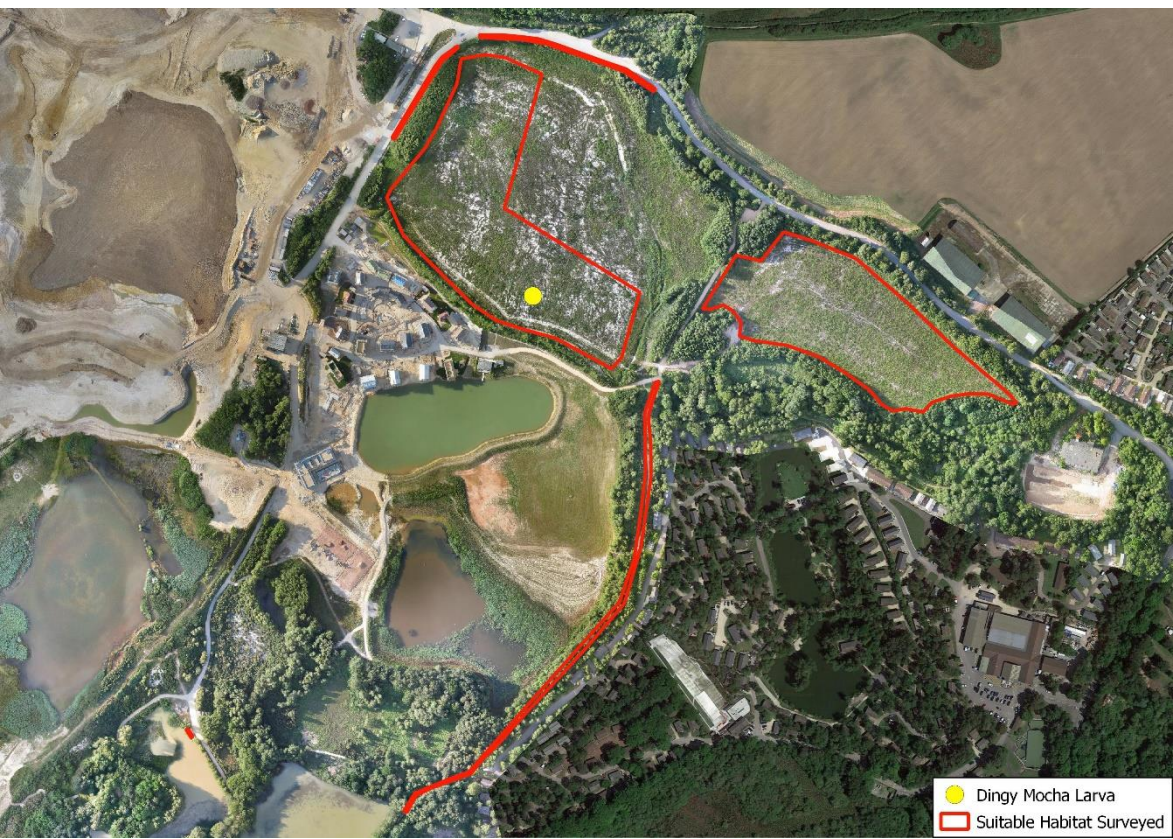
Figure 2. Location of Dingy Mocha larvae and areas of suitable habitat surveyed.

A walking survey for suitable habitat was undertaken across the whole of Warmwell Heath, and in the Tadnoll Brook valley between the Heath and Silverlake. However, no habitat was found to support the moth in the wider area. The grazing on the Heath and in the valley appears to have reduced the availability of bushes of Grey Willow in the right condition to support the moth.