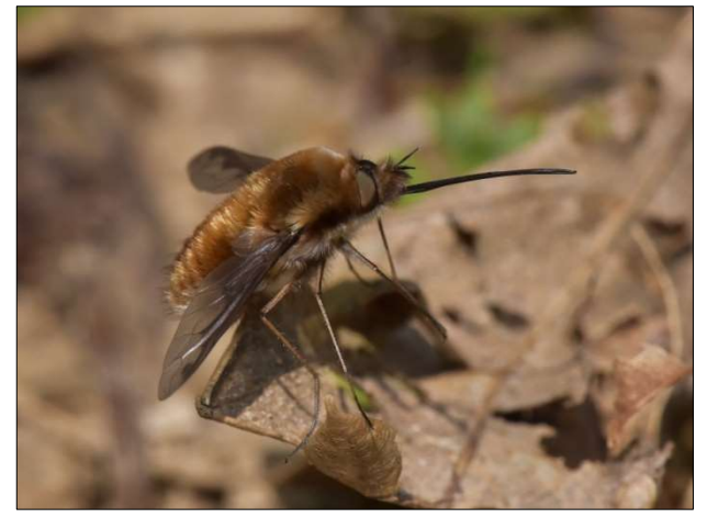
Bombylius major Dark-edge Bee-fly

A frequent spring-flying bee-fly found along the edges of heaths and around scrub where it targets the nest burrows of spring-flying mining bees ( Andrena species) often on south-facing banks. Seen in several places at Silverlake from mid-March to May.