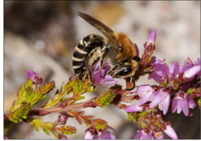
Colletes succinctus Heather Colletes A specialist bee foraging from Ling in late summer, found on Woodlark Heath in 2021.