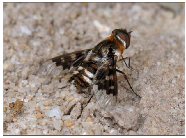
Thyridanthrax fenestratus Mottled Bee-fly

A frequent spring-flying bee-fly found along the edges of heaths and around scrub where it targets the nest burrows of spring-flying mining bees ( Andrena species) often on south-facing banks. Seen in several places at Silverlake from mid-March to May.