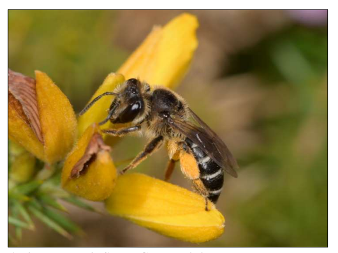
Andrena ovatula Small Gorse Mining Bee A small double-brooded mining bee, the second brood forages from Dwarf Gorse flowers on the heaths.