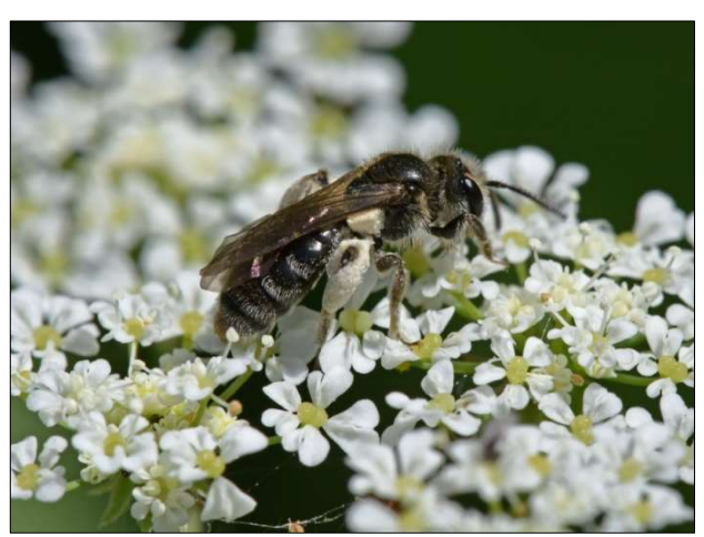
Female Andrena semilaevis Shiny-margined Mini-miner A small single brooded bee favouring flowery marginal habitat often foraging from umbellifers such as Cow Parsley and Hogweed.