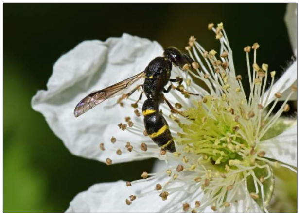
Female Symmorphus bifasciatus A slender mason wasp which nest in cavities in wood and in hollow stems, predatory on the larvae of Chrysomelid beetles, particularly the willow feeding Phratora vulgatissima .