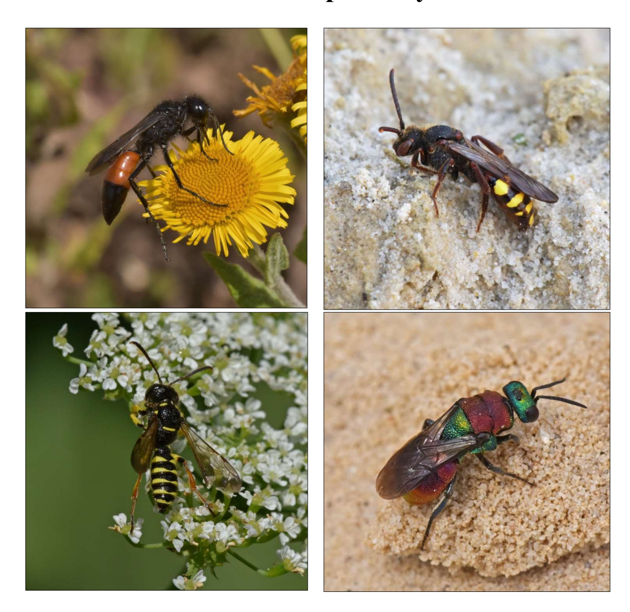
FINAL REPORT June 2022