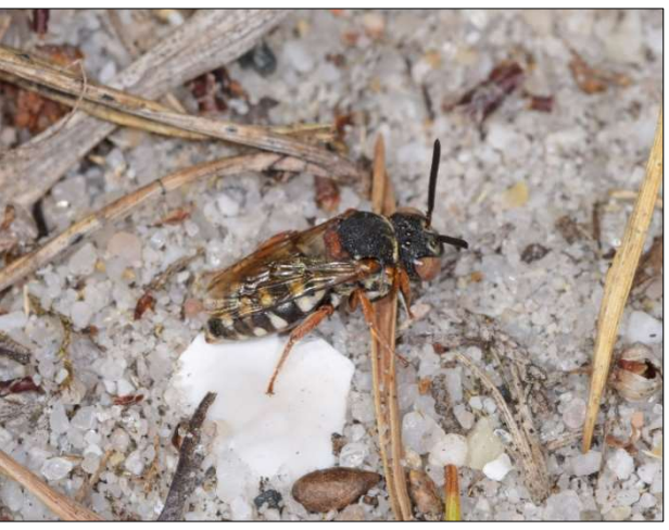
Epeolus cruciger Red-thighed Epeolus A nest-parasite targeting Colletes succinctus .