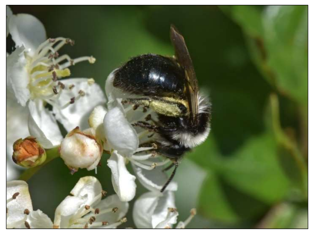
Female Andrena cineraria Ashy Ming Bee One of the characteristic spring species often found in gardens which forages from a wide range of flowers and blossom.