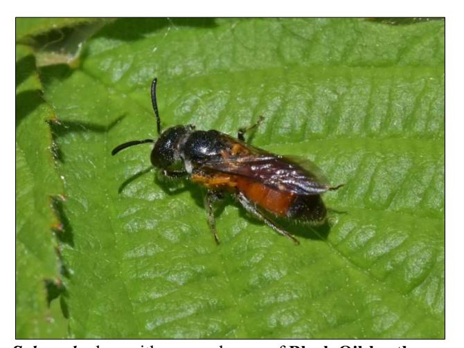
Sphecodes bee with orange larvae of Black Oil-beetle

This member of the Anthomyiidae is found around the burrows of mining bees, in this case Andrena clarkella . The fly enters the burrow and lays its eggs on the pollennectar food reserves meant for the developing bee grub. The record from Silverlake appears to be the first for Dorset.