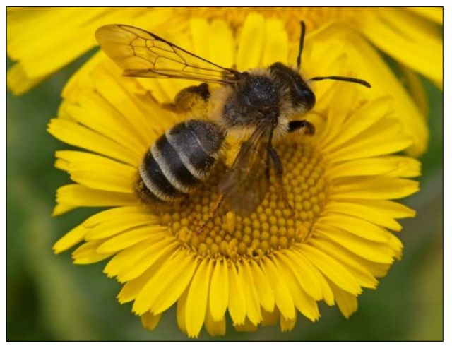
Andrena denticulata Grey-banded Mining Bee A stout, dark mining bee that forages from yellow composites such as Fleabane and Ragwort.