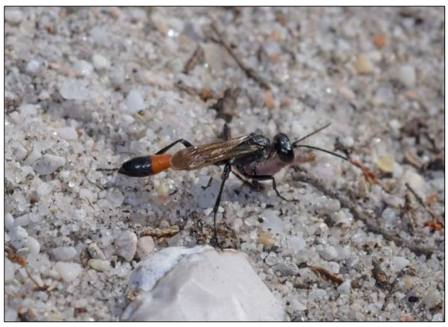
Ammophila pubescens Heath Sand Wasp NS A slender-bodied sand-wasp confined to the heath of southern England where it is host to the S41 bee-fly Thyridanthrax fenestratus.