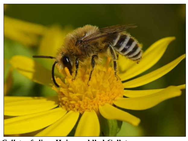
Colletes fodiens Hairy-saddled Colletes This species is listed as Vulnerable on the European Red List, it forages from Ragwort and Fleabane.