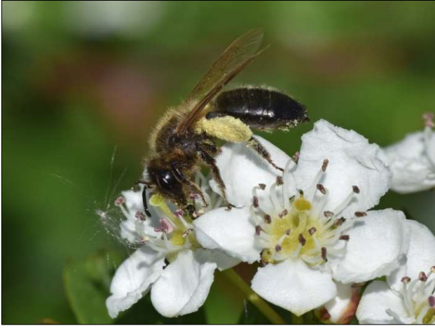
Female Andrena scotica Chocolate Ming Bee A widespread spring flying bee found in a range of habitat particularly hedgerows and scrub edge.