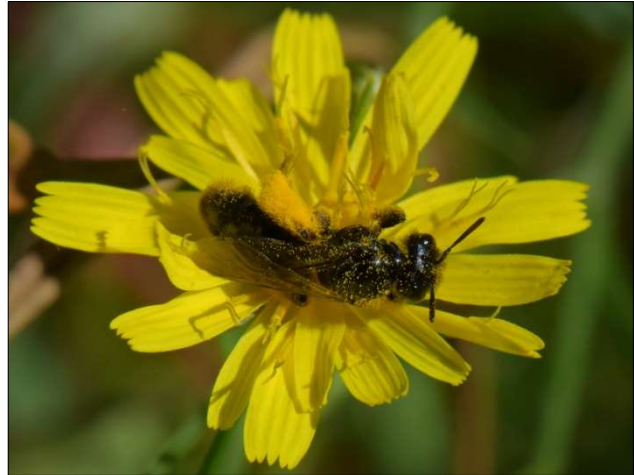
Panurgus calcaratus Small Shaggy Bee A small hairy black bee that forages from yellow composites such as Lesser Hawkbit and Common Cat's-