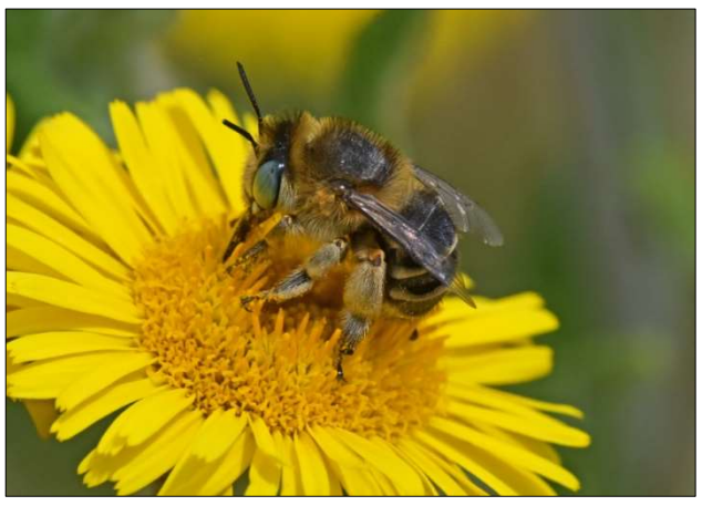
Anthophora bimaculata Green-eyed Flower Bee A frequent mid-summer bee in flowery grassland across the site, including the wildflower banks around Beaumont Village.