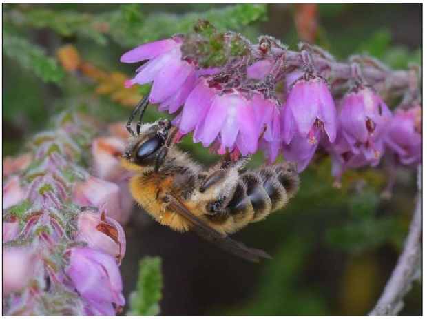
Andrena fuscipes Heather Mining Bee Like Colletes succinctus this mining bee forages almost exclusively from the flowers of Ling.