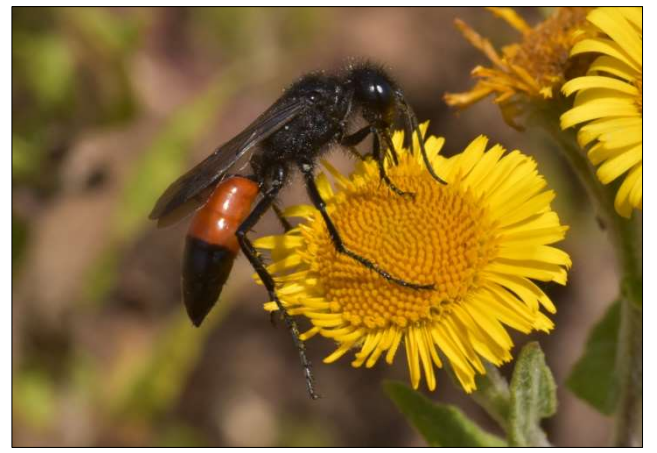
Podalonia hirsuta Hairy Sand-wasp NS A large stout sand-wasp found in several locations across the site. Females can overwinter and emerge in early spring.