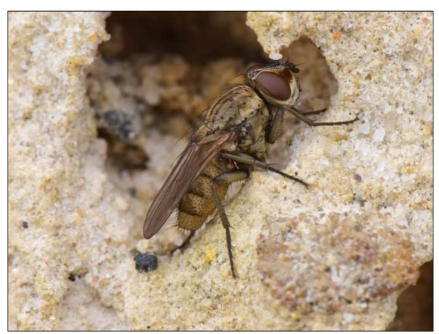
Leucophora obtusa a 'satellite fly'

A Section 41 bee-fly strongly restricted to lowland heathland in Britain where it targets the nests of the sandwasp Ammophila pubescens on bare ground and along tracks. Recorded in 2020 from Woodlark Heath.