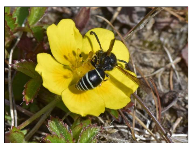
Odynerus melanocephalus Black-headed Mason Bee This Section 41 bee is mainly coastal in Dorset but does occur inland in old mineral workings. The females predate weevil larvae, several males were seen on Creeping Cinquefoil flowers in acid grassland.