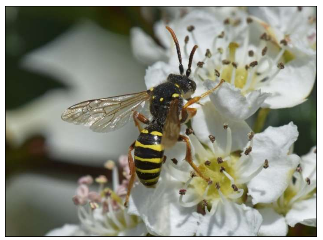
Male Nomada goodeniana Gooden's Nomad Bee One of the most frequent large nomad bees with a black and yellow abdomen targeting the single brooded Andrena nitida and double-brooded A. thoracica .