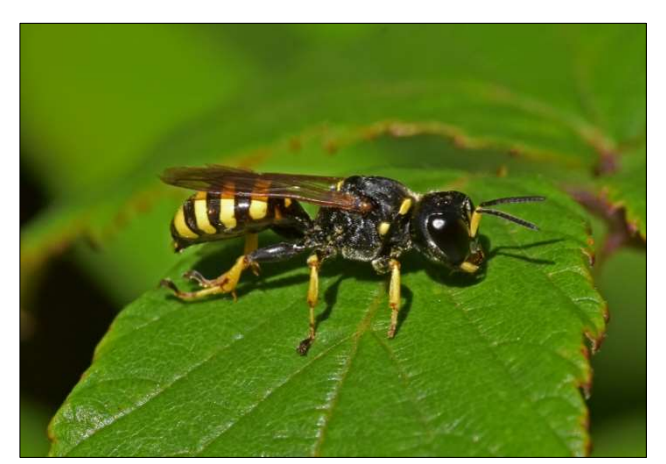
Female Ectemnius cavifrons One of several medium-sized black and yellow bodied wasps found in edge habitat, predatory on flies and hoverflies and often seen on umbellifer flowers searching for nectar.