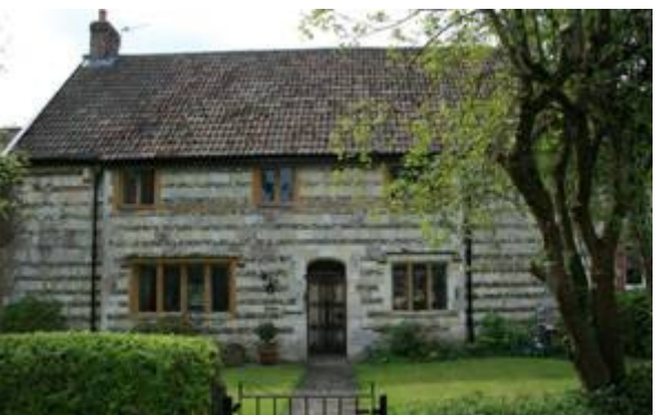
Figure 62: Barton Farm House.