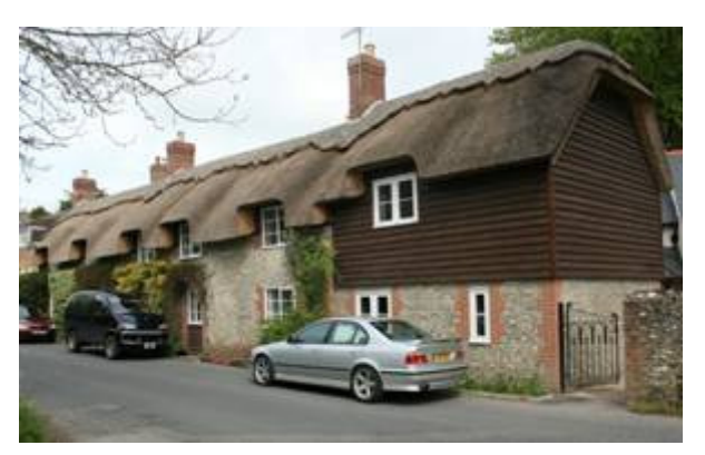
Figure 67: 3 and 5 The Folly.