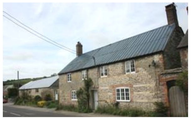
Figure 64: View of Francombe Farm and Barn, Acreman Street .