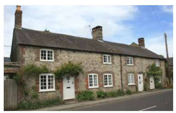
Figure 65: 13-17 Acreman Street, a row of brick and flint cottages attached to Francombe Farmhouse.

18<sup>th</sup> and 19<sup>th</sup> century cottages and villas : Barton Lodge, 13-15 The Folly, 5-7 Acreman Street.