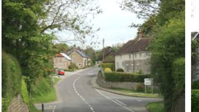
Figure 61: View north along Acreman Street.