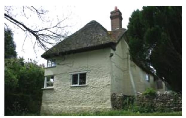
Figure 66: 19 Acreman Street.