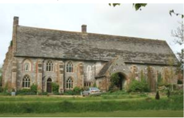
Figure 63: The Tithe Barn.

The settlement pattern along Acreman Street, Dorchester Road and The Folly is varied, with a range of historic cottages, small terraces, farm and industrial buildings within irregular plots or plots enclosed from former furlongs. This pattern has been added to in a piecemeal fashion during the 20<sup>th</sup> century with isolated inter-war housing and a post-war estate of semi-detached houses on a linear cul-de-sac at Acreman Close. The alteration of Acreman Street in the 1960s led to the construction of semi-detached bungalows within truncated historic plots fronting on to the new road line. In the late 20<sup>th</sup> century modern housing estates on curvilinear culs-de-sac or arranged in courtyards have been established at Springfields and Barton Farm.