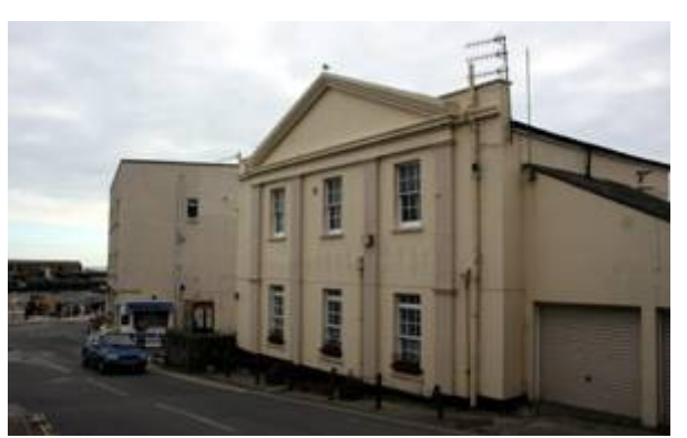
Figure 67: Former Customs House, Cobb Road.