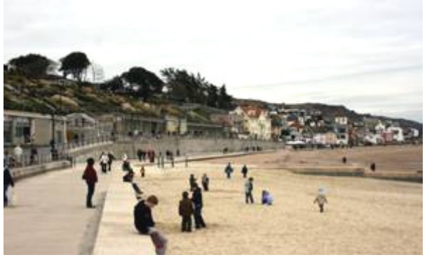
Figure 63: Marine Parade with Langmoor Gardens behind, looking towards the town.

The settlement pattern is varied across the area. In Cobb hamlet the houses are of high density, set directly on the street frontage or in terraces set transversely with the gable end on to the street. The streets are narrow and steep, with a small square immediately behind the Cobb with the Cobb Arms set prominently on one side. The inter-war houses to the north of Cobb hamlet are all set well back from the road in generous gardens with views over Lyme Bay. The other prominent settlement element is the seafront housing along Marine Parade. Open recreational space in the form of the public gardens and seafront are a major component of this area. The view of the sea and beach is one of the main visual aspects of this area.