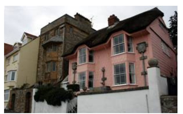
Figure 70: Library Cottage and Sundial, Marine Parade.

No Scheduled Monuments lie within this character area.