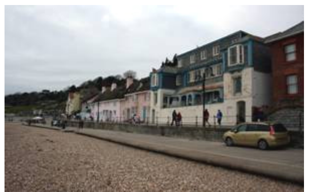
Figure 61: Houses along Marine Parade.