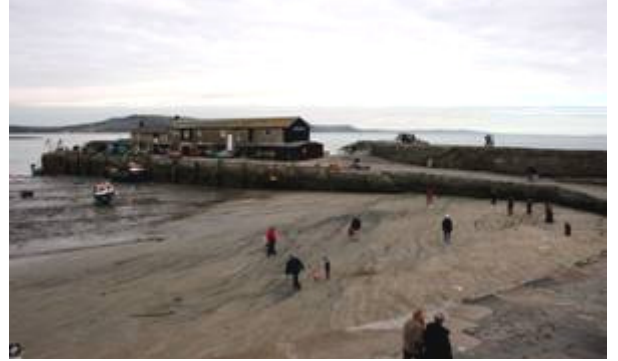
Figure 64: The Cobb and buildings on the Cobb.