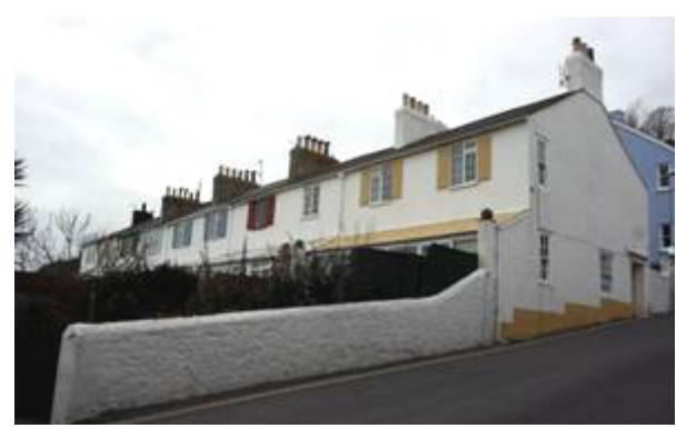
Figure 66: Cobb Terrace.