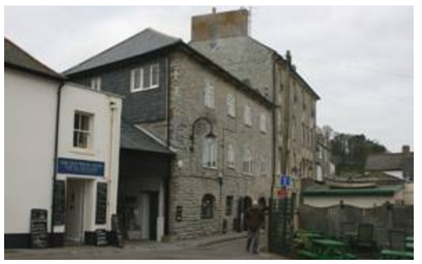
Figure 65: Former bonded warehouse and Cobb House.

Other Buildings : Old Bonded Warehouse, the Old Watch House, RAF Barracks, the Cobb Arms.