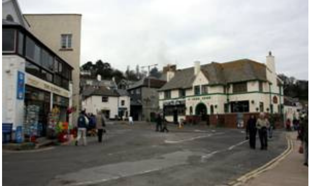
Figure 62: Cobb Square.