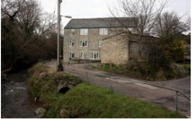
Figure 22: Higher Mill.