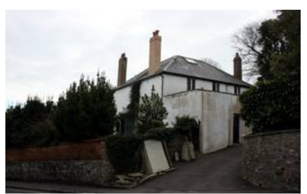
Figure 21: Little Place, Silver Street.