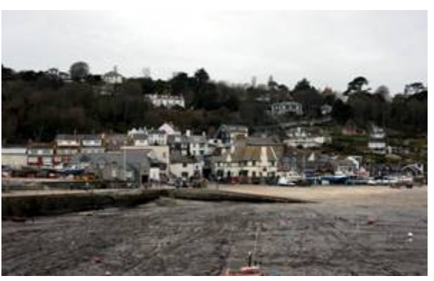
Figure 17: Cobb Hamlet with large villas on slopes behind.