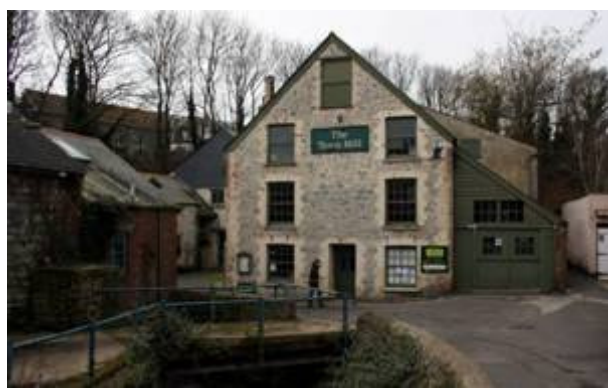
Figure 19: Town Mill.