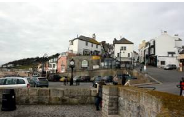
Figure 15: Cobb Gate with Marine Parade to left, Broad Street to right and site of Assembly Rooms, centre.