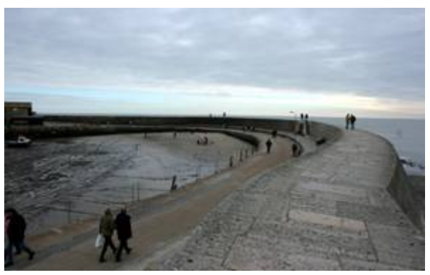
Figure 14: View along the Cobb, showing rebuild of 1824/5 in large Portland stone blocks.

There was some trade in the Newfoundland fishery and the Mediterranean in the 19<sup>th</sup> century and also regular ships to the Channel Is-