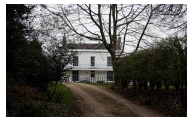
Figure 20: Haye House.