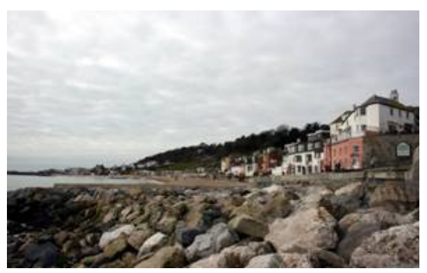
Figure 16: View of Marine Parade looking towards Cobb Hamlet.