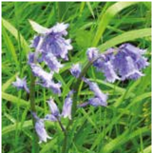
Green hairstreak butterfly on bluebells

The Wareham Forest Way Walking Trail is just over 13 miles long and follows public rights of way and minor roads between Wareham and Sturminster Marshall.