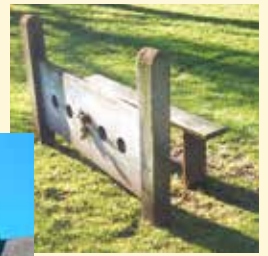
Stocks at Sturminster Marshall