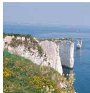
Old Harry Rocks

The Purbeck Way passes through some of the most varied and spectacular scenery in Britain. After leaving the River Frome and its water meadows, the route continues through heathland, woodland and grassland before arriving at the dramatic scenery of England's first natural World Heritage Site, the 'Jurassic Coast'. The route then continues along the South West Coast Path from Ballard Down to Chapman's Pool. North of Wareham there are links with the Wareham Forest Way and beyond to Blandford and Christchurch via the Stour Valley Way.