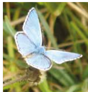
Adonis blue butterfly

Purbeck is home to many nationally rare species. Some, like the ladybird spider, are only found in Dorset. Fortunately much of the area is managed by sympathetic landowners or conservation bodies like the National Trust, so their future is in safe hands.