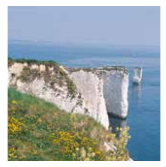
Old Harry Rocks

The Purbeck Way passes through some of the most varied and spectacular scenery in Britain. After leaving the River Frome and its water meadows, the route continues through heathland, woodland and grassland before arriving at the dramatic scenery of England's first natural World Heritage Site, the 'Jurassic Coast'. The route then continues along the South West Coast Path from Ballard Down to Chapman's Pool. North of Wareham there are links with the Wareham Forest Way and beyond to Blandford and Christchurch via the Stour Valley Way.