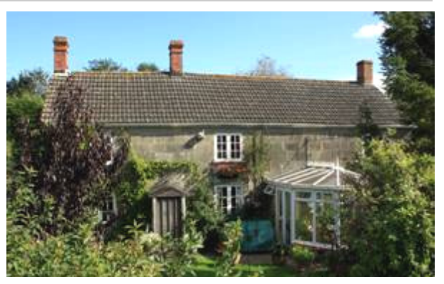
Figure 130: Highbank Cottage, Little Down.

19<sup>th</sup> century suburban villas: 1-6 Grosvenor Road.