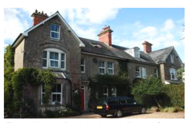
Figure 132: Late Victorian suburban villas, 1-6 Grosvenor Road.