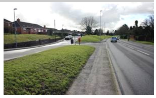
Figure 123: View along Grosvenor Road towards Shaftesbury.

Figure 122 shows the present day historic urban character types. Modern Housing Estates dominate, together with two Industrial Estates. Schools, Cemetery and Public Park also form large individual elements within the area. Along Grosvenor Road are narrow strips of Cottages. Small Inter-war Suburban Estates are aligned along Christy's Lane, Mampitts Road and Grosvenor Road. Other minor character types include Ornamental Villas and Country Houses, Modern Infill, Other Modern Housing, Other Commercial Site, Emergency Services Building, and Sewage Works/Water Works.