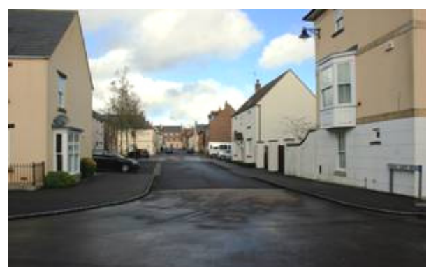
Figure 133: Thomas Hardy Drive, a modern housing development, dated 2000.