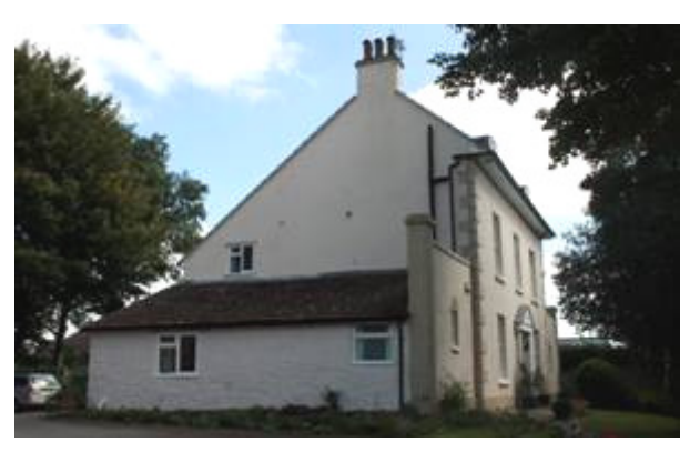
Figure 131: Little Content House, formerly Barton Villa.