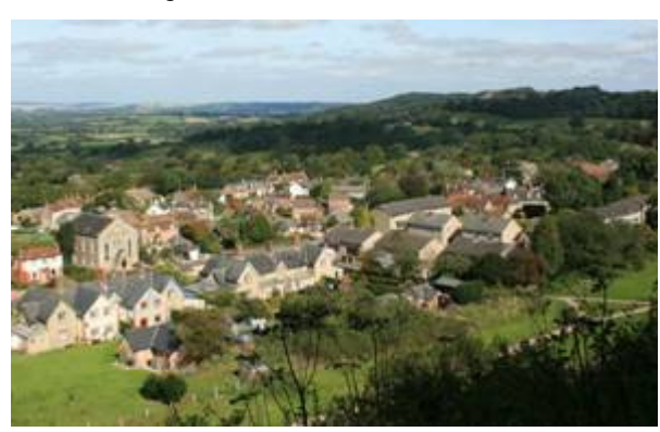
Figure 26: View of Enmore Green from Castle Hill.