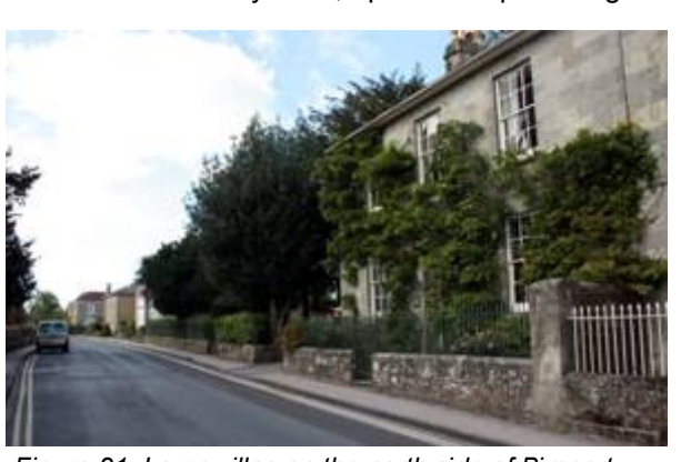
Figure 21: Large villas on the north side of Bimport.