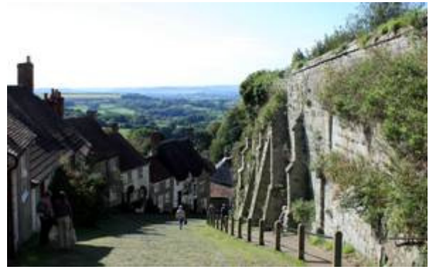
Figure 25: View down Gold Hill with Abbey precinct wall on the right.