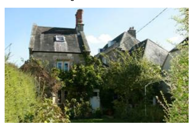
Figure 23: The Old School House and Abbey House, Abbey Walk.