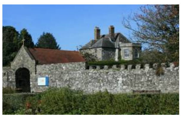
Figure 20: Abbey House, built on the site of the former abbey.

The Hearth Tax returns of 1662-4 suggest the town remained relatively large during the 17<sup>th</sup> century (Meeking 1951). However, Daniel Defoe described the town in the early 18<sup>th</sup> century as '...now a sorry town, upon the top of a high