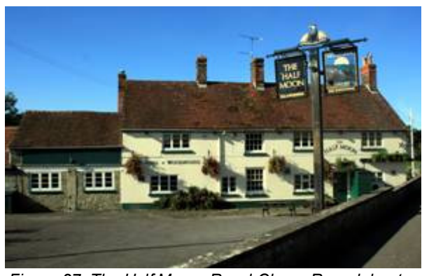
Figure 27: The Half Moon, Royal Chase Roundabout, Cann.