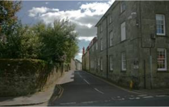
Figure 24: View along Parson's Pool from Bleke Street