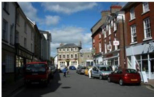
Figure 14: View of the Commons, High Street.