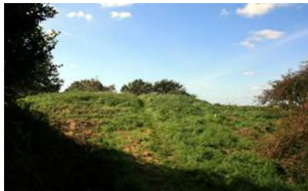
Figure 19: The substantial bank and ditch at Castle Hill.