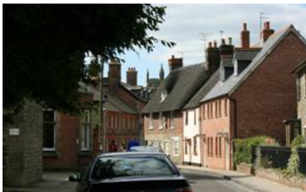
Figure 18: Historic buildings on Bell Street with Holy Trinity tower in the background.

15. Holy Trinity Church . The Church of the Holy Trinity was first recorded in 1302 and lay within