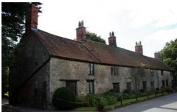
Figure 15: Edwardstowe, Bimport.

The rise in importance of the abbey during the medieval period seems to have changed the focus of the medieval town. The former burh and market at Bimport (part of the royal manor) became less intensively occupied. The focus of the town was now in the area to the east of the abbey, which probably expanded and developed beyond the pre-Conquest extra-mural settlement. The central town plots may have been planned and arranged along the approximately parallel streets of Bleke Street, Bell Street and High Street. Side streets linking these three parallel streets include Parson's