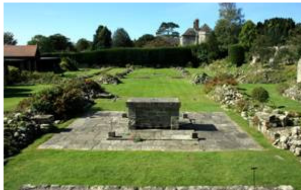
Figure 16: The nave and chancel of the 11 th -12 th century abbey church .