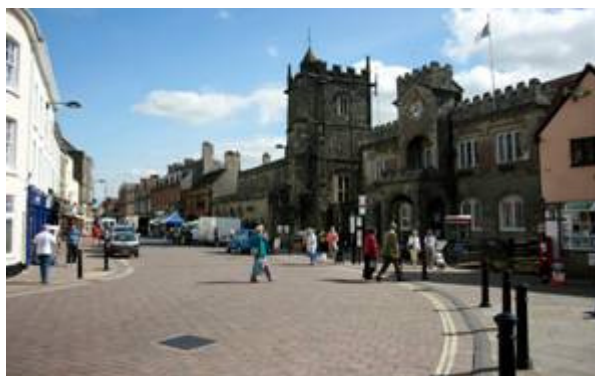
Figure 13: View of the High Street showing St Peters Church and the 19 th century Town Hall .

Shaftesbury appears to have had some degree of economic success during the 13 th and 14 th centuries. Fourteenth century documents such as the Lay Subsidy (Mills 1971, 55-6) and the Inquisitio Nonarum show that Shaftesbury was the most populous Dorset town at that time (Penn 1980, 85). The Lay Subsidy of 1332 suggests that Shaftesbury was the wealthiest town in Dorset in the early 14 th century, almost as wealthy as the next two biggest (Weymouth and Bridport) combined. It had a number of modestly wealthy inhabitants, but no very rich taxpayers. Shaftesbury was represented as a borough at the eyre of 1244 and sent members to parliament from 1295. Shaftesbury's weekly market is first recorded in 1269 when the charter was confirmed by Henry III during 1269