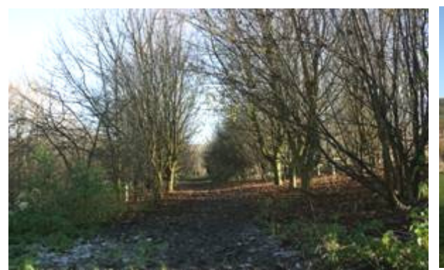
Figure 123: Scrubby woodland on ridge south of school.