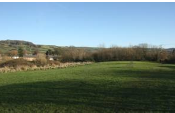
Figure 124: View of public open space along ridge to south of school, looking east.