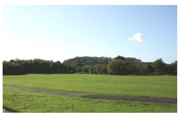
Figure 119: Beaminster School playing fields viewed from Newtown, looking southwest.

There is no settlement within this character area. There is one former dwelling in the northern part, adjacent to the school, but this now forms part of the school buildings. The Newtown road forms the eastern edge of the school grounds.