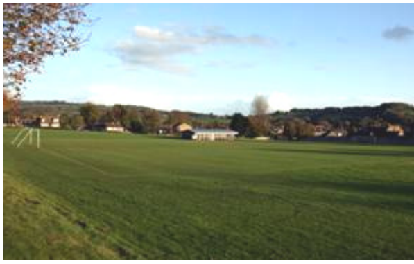
Figure 117: View of Memorial Playing field from northwest.