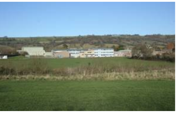
Figure 118: View of Beaminster School and playing fields from south.