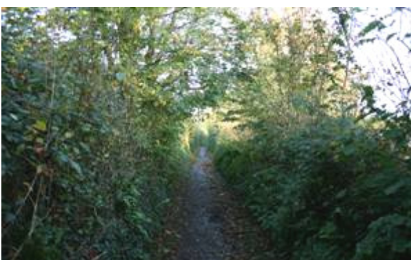
Figure 120: Relict green lane north of the Memorial Playing Fields, looking east.