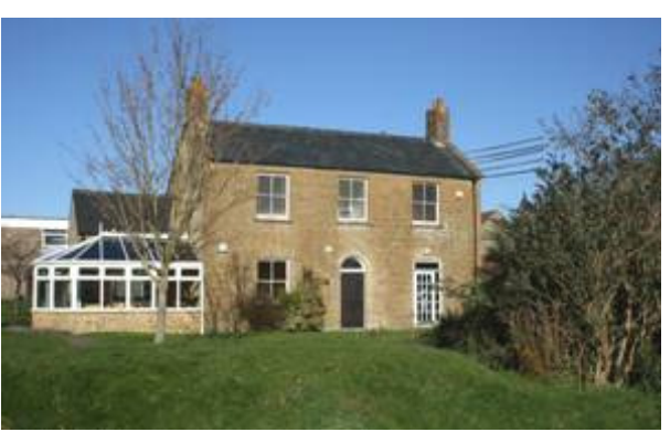
Figure 122: Sandhurst House.