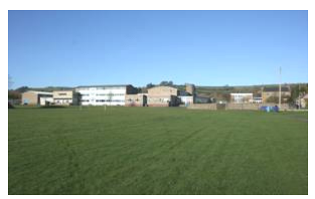
Figure 121: Beaminster School, viewed from south.

Beaminster School Buildings, Sandhurst House.