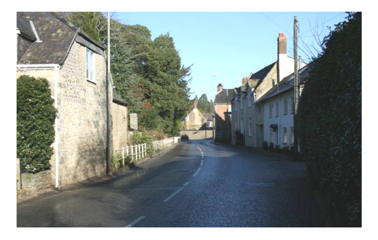
Part 1: Introduction