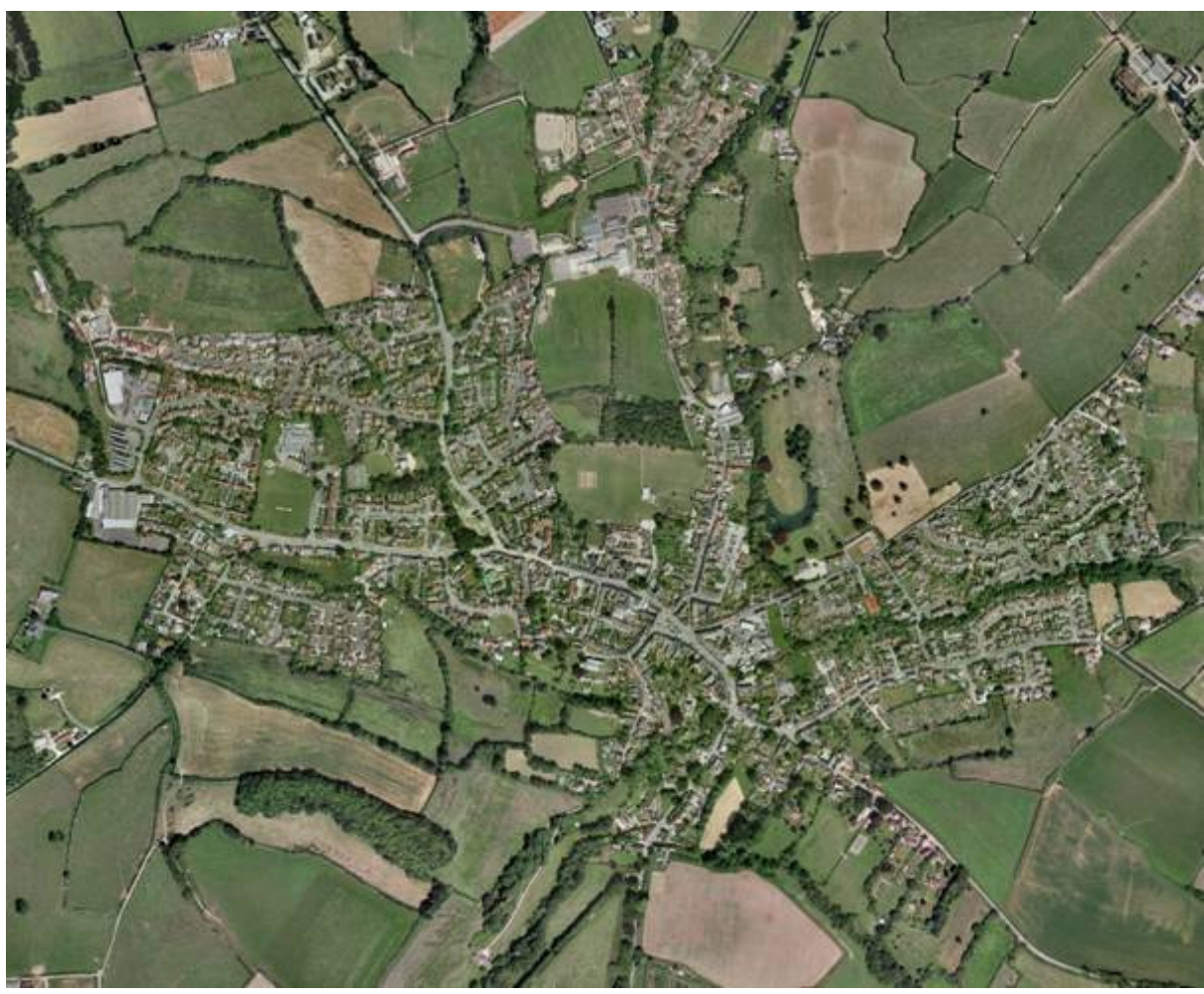
Figure 1: Vertical aerial photographic view of Beaminster, 2005.

The good survival of the historic structure is complemented by the high quality and large quantity of historic buildings. The survival in the historic core of a large number of unbroken groups of buildings, with little disruption from modern development, is a major factor which highlights the contribution made by historic elements to Beaminster's urban character. The harmonious use of a range of local building materials helps underscore its local setting and emphasises the linkage with the surrounding landscape.