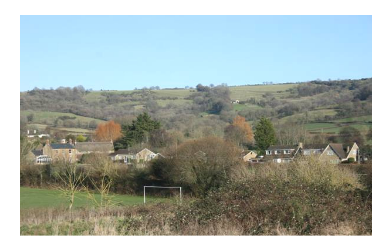
Part 2: Overview of Approach