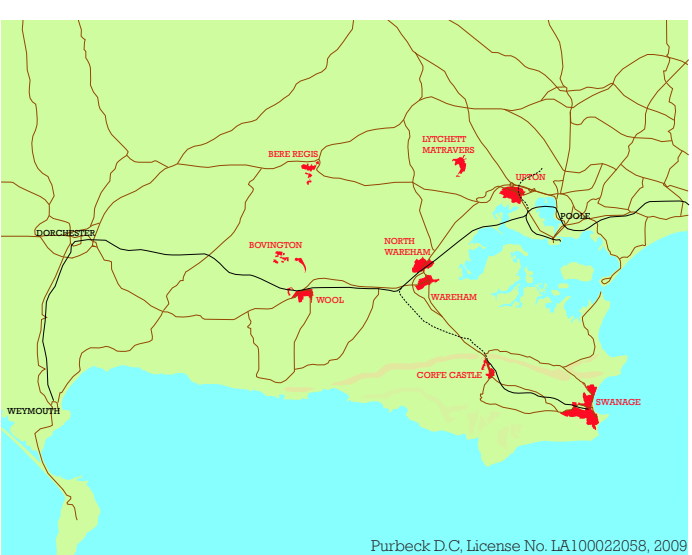
Map of Purbeck identifying the settlements included in the study