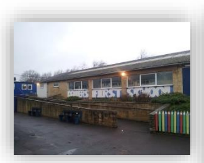
School grounds project before and after photos; England