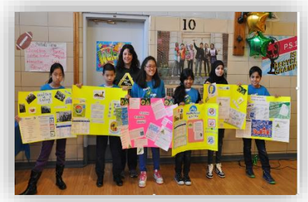
Curriculum work; USA