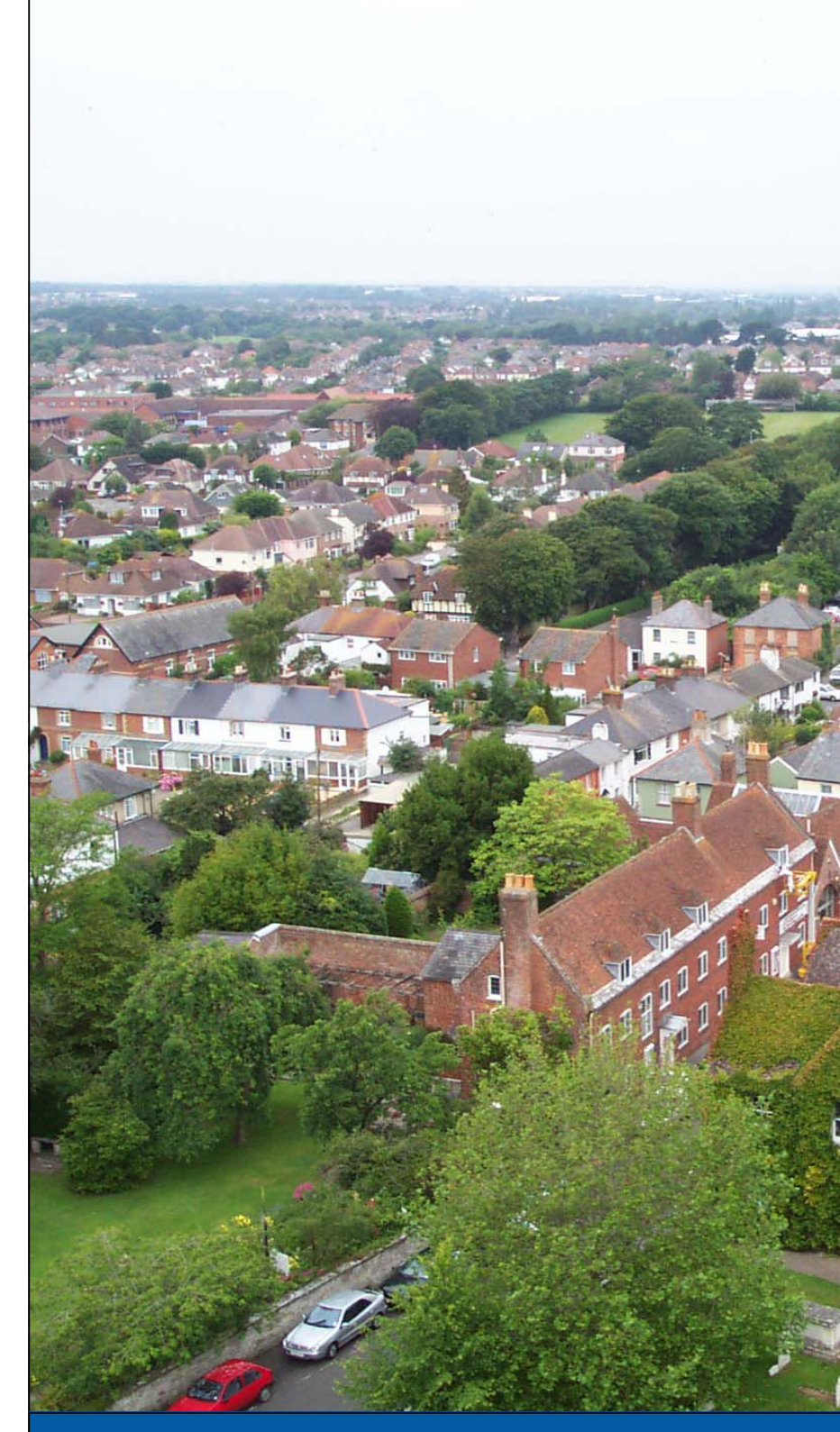
5.0 The Built Up Area