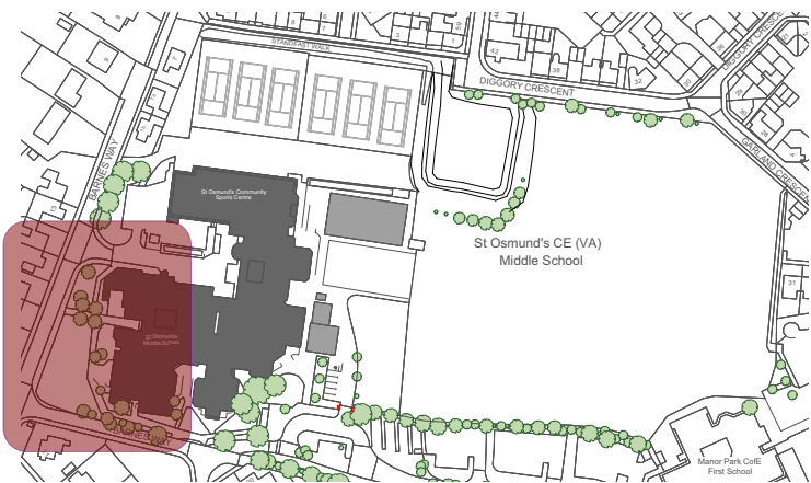
KEY PLAN NTS