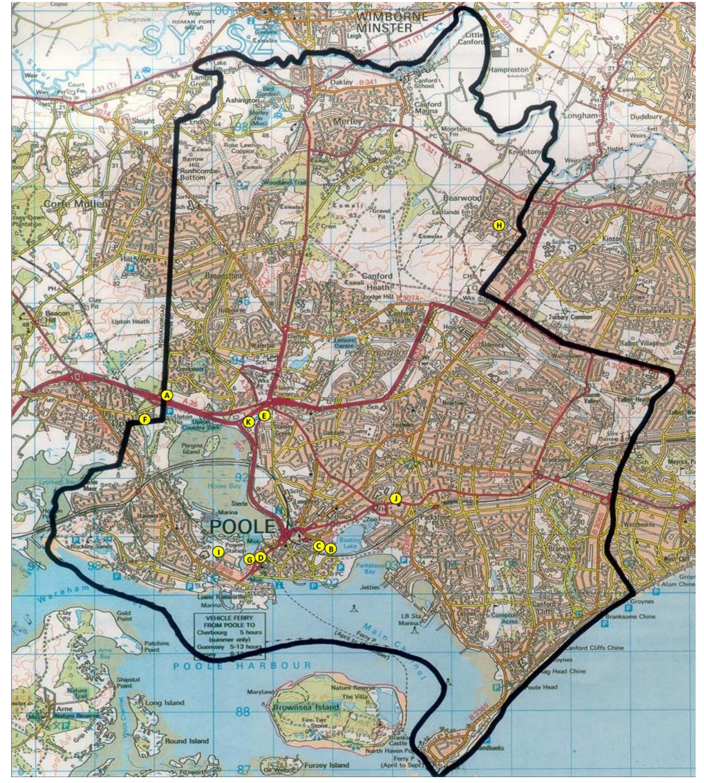
Map 2 - Further sites that have been previously considered and rejected O