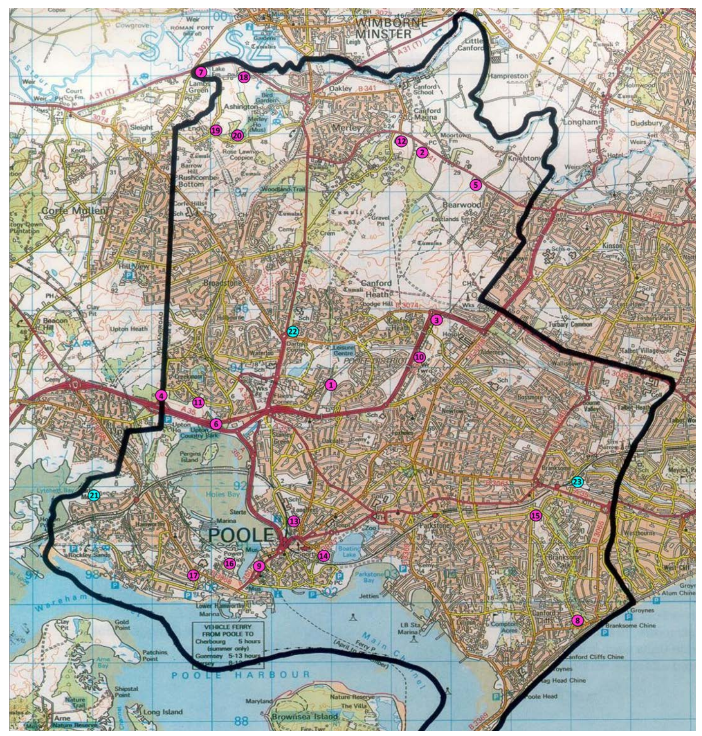
Map 1 - Location of sites assessed by consultants, rejected sites, shortlisted sites