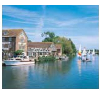
Meadows at West Holme Ford and Bridge at East Holme Wareham Quay