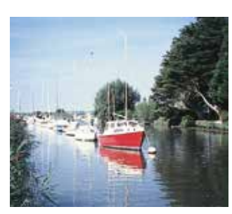
Lulworth Cove Coombe Keynes River Frome