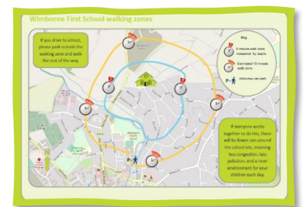
Schools make use of the 5-minute walk zone maps