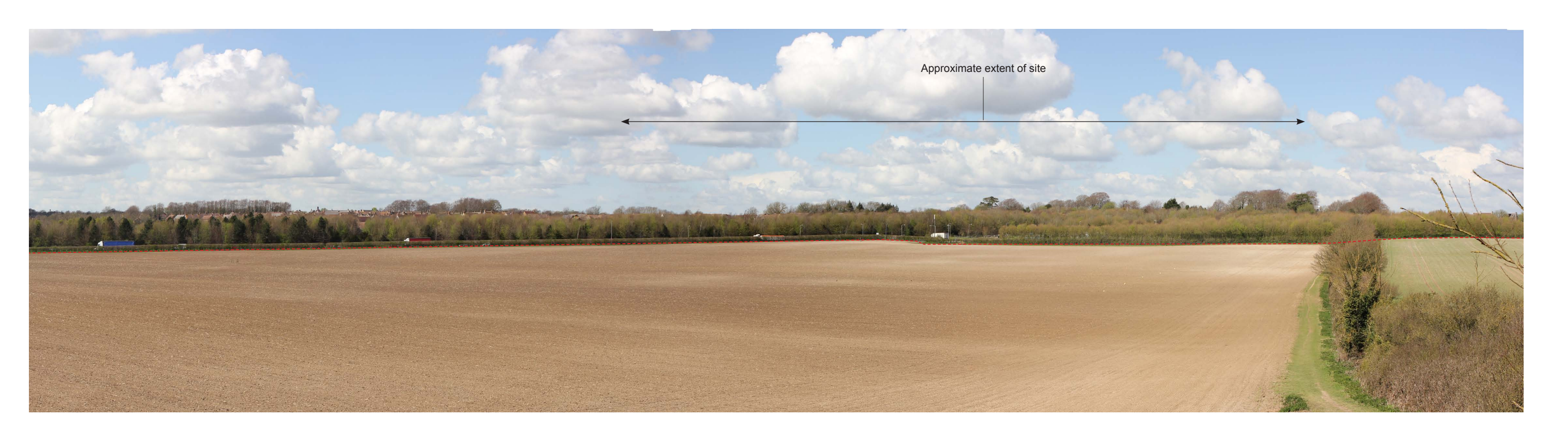
Photoviewpoint 4b: View from the public bridleway to the south of site, looking east.