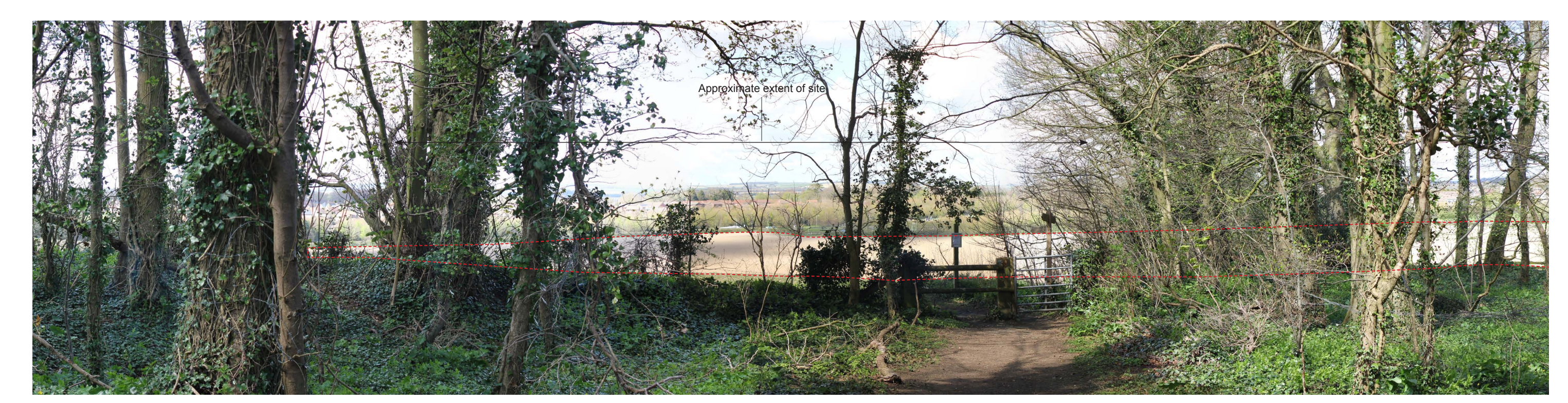
Photoviewpoint 6: View from North Plantation to the south of site, looking north west.