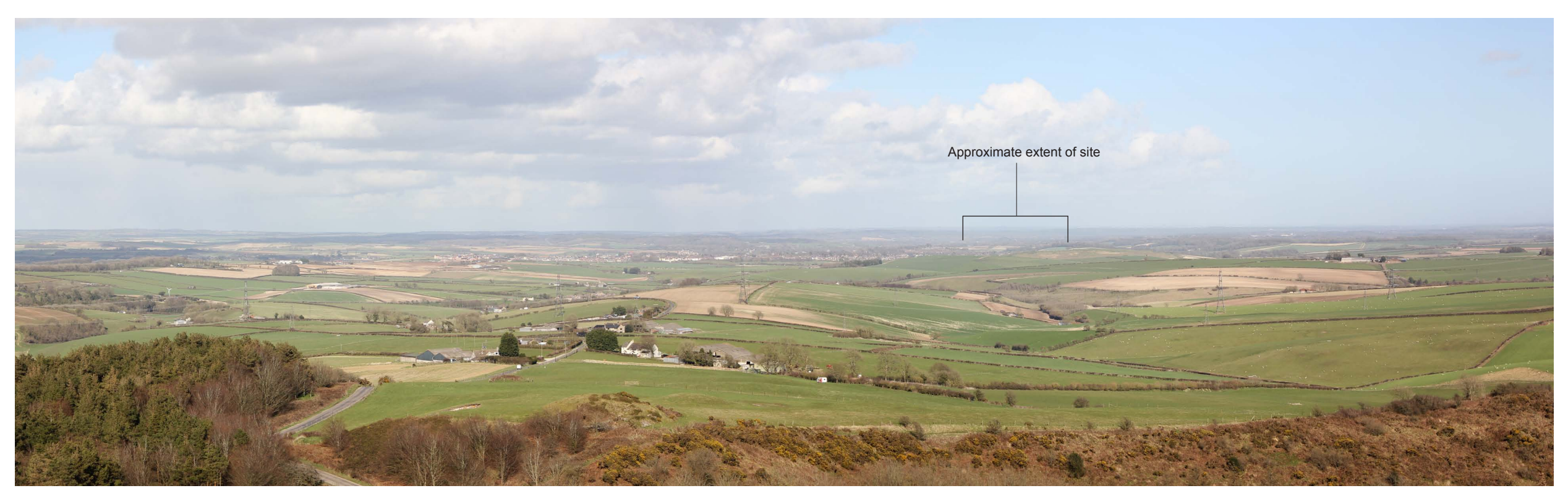
Photoviewpoint 18: View from the base of the Hardy Monument, looking north east.