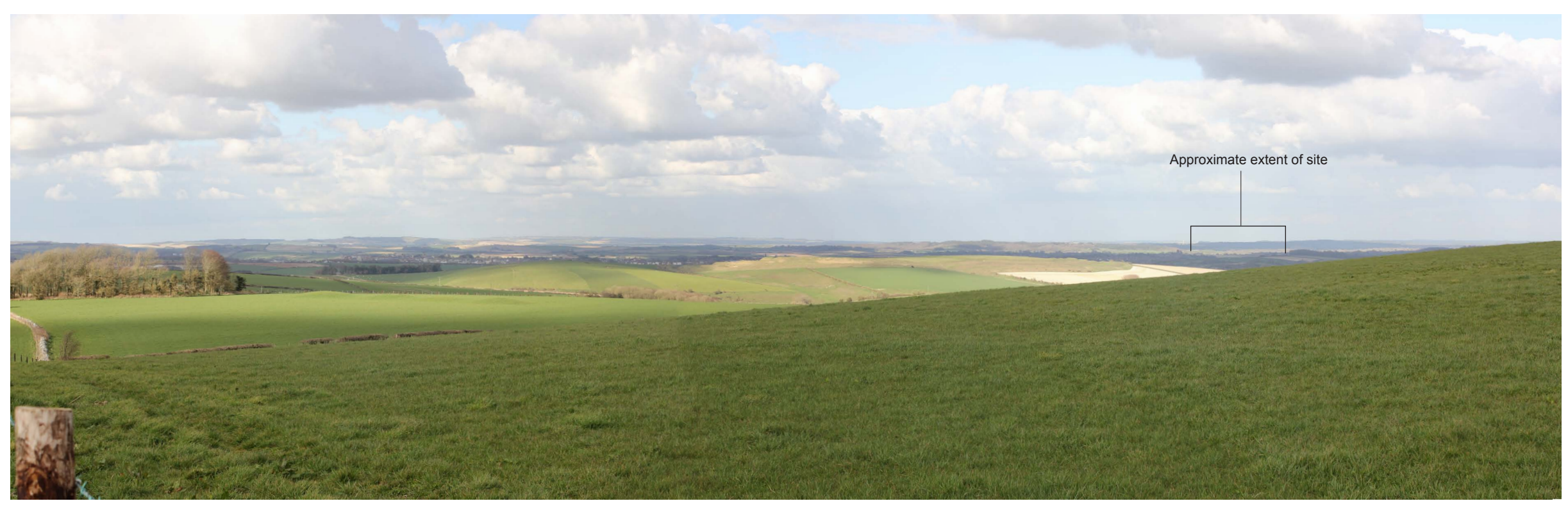
Photoviewpoint 17: View from the South Dorset Ridgeway (National Trail) to the south of Eweleaze Barn, looking north east.