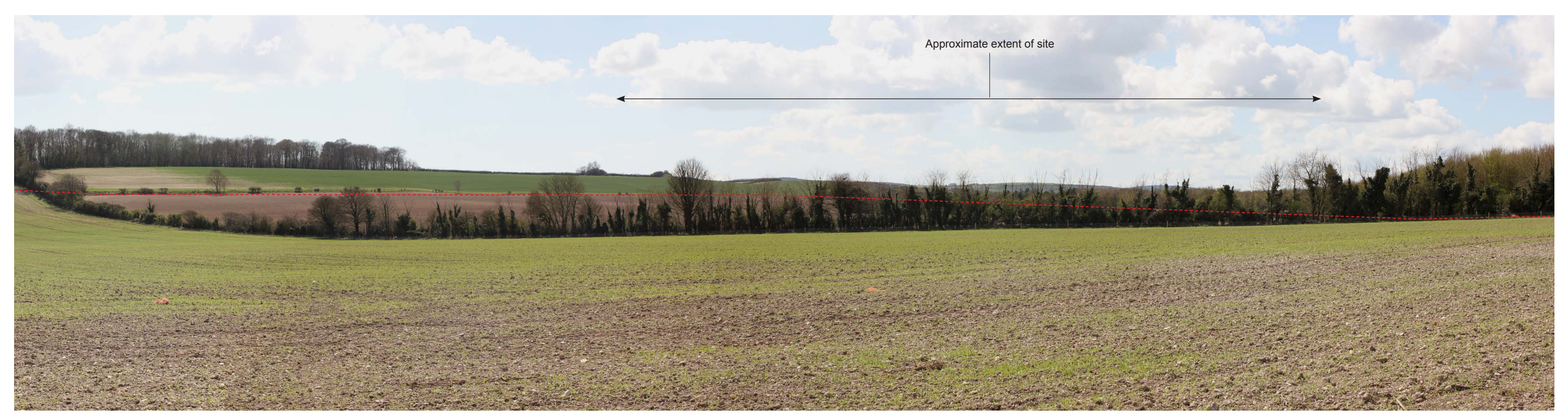
Photoviewpoint 1b: View from the A352 to the north east of site, looking south.