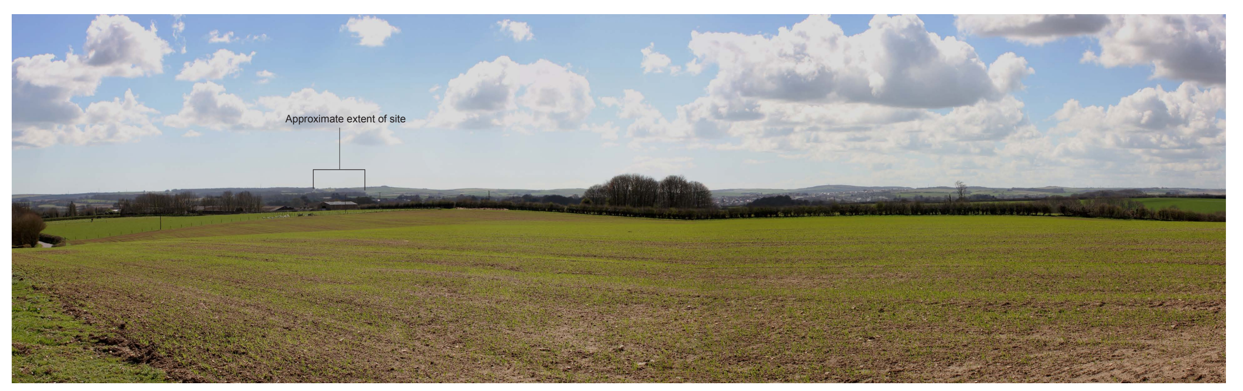
Photoviewpoint 14: View from Cuckoo Lane, south of the A35, looking south west.