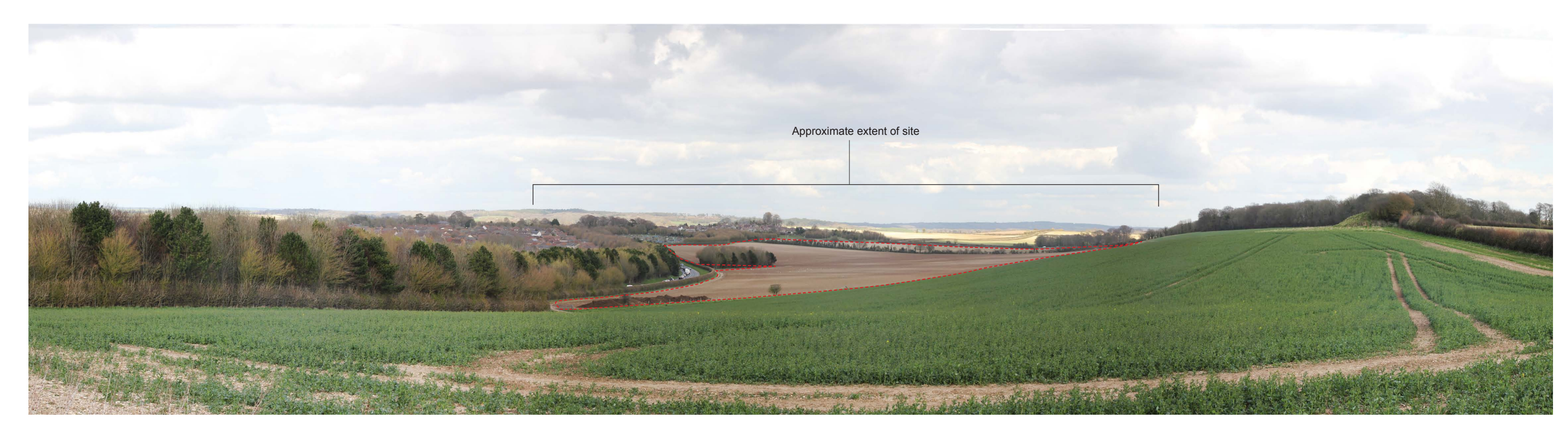
Photoviewpoint 8: View from the public footpath to the south of the A35, looking north east.