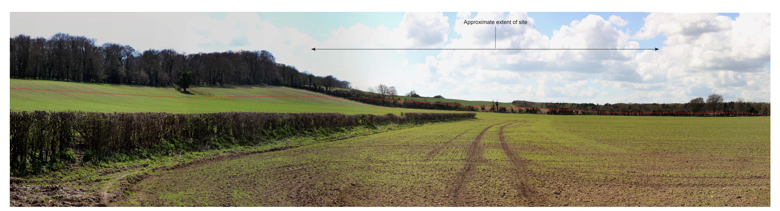
Photoviewpoint 3: View from the public footpath leading off the A352, looking west.