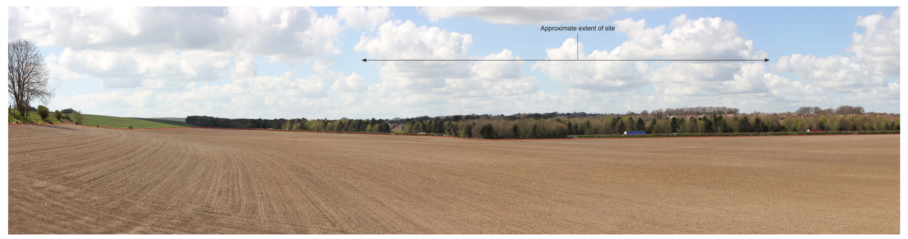
Photoviewpoint 4a: View from the public bridleway to the south of site, looking east.