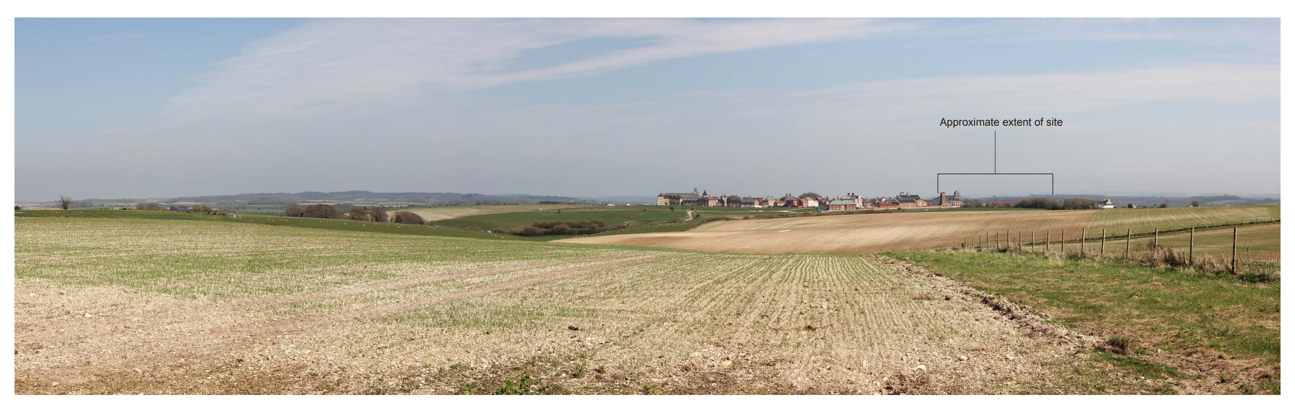
Photoviewpoint 13: View from the public footpath east of Tilly Whim Lane, looking east.