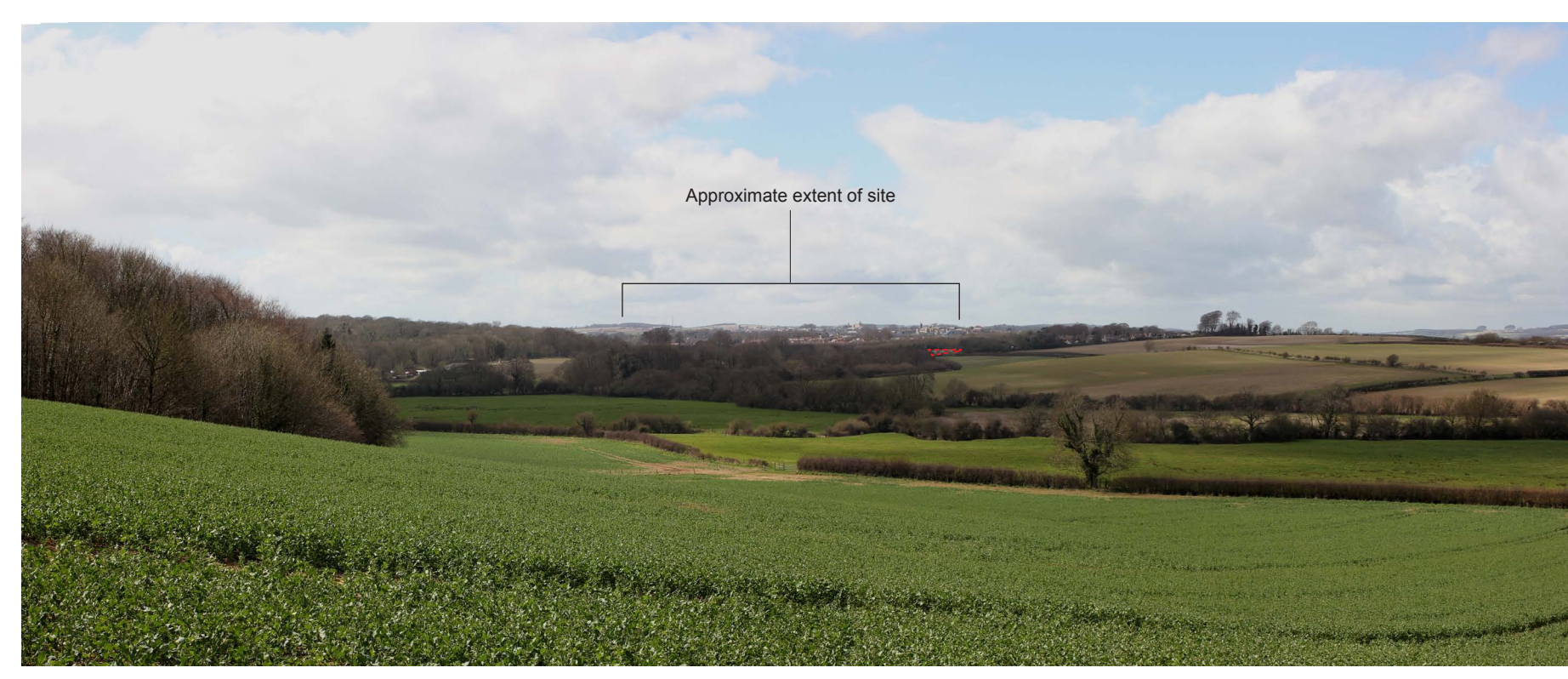
Photoviewpoint 7: View from the public bridleway north west of Stafford Farm, looking north west.