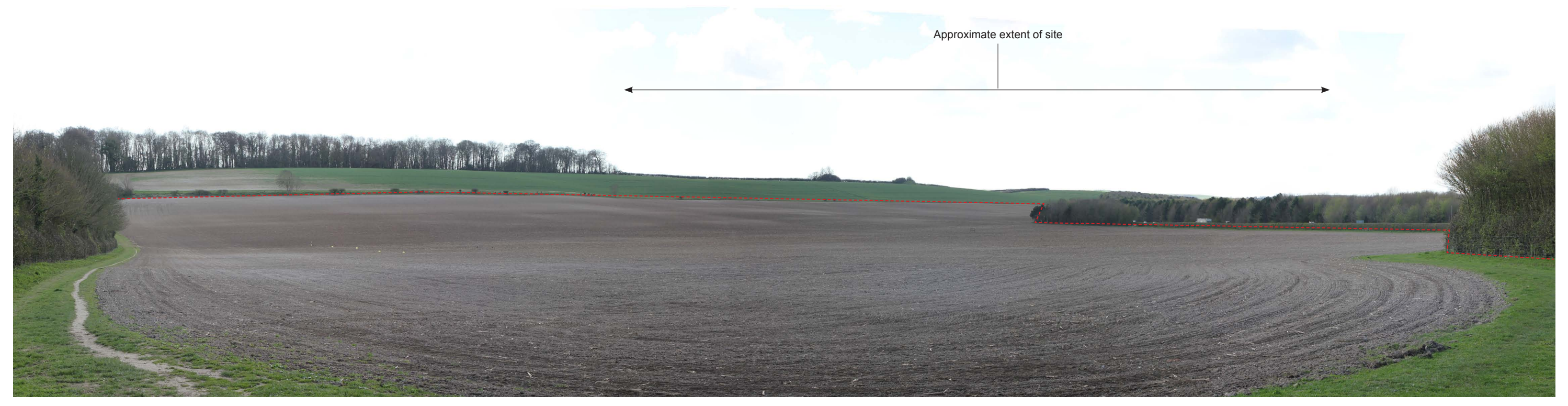
Photoviewpoint 2: View from the public bridleway north of site, looking south west.