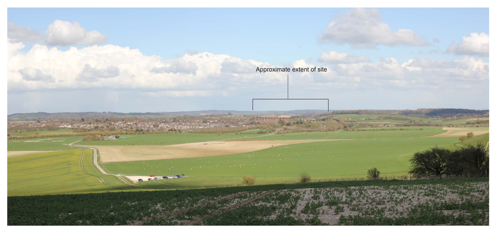
Photoviewpoint 11: View from the public bridleway, west of Maiden Castle, looking east.