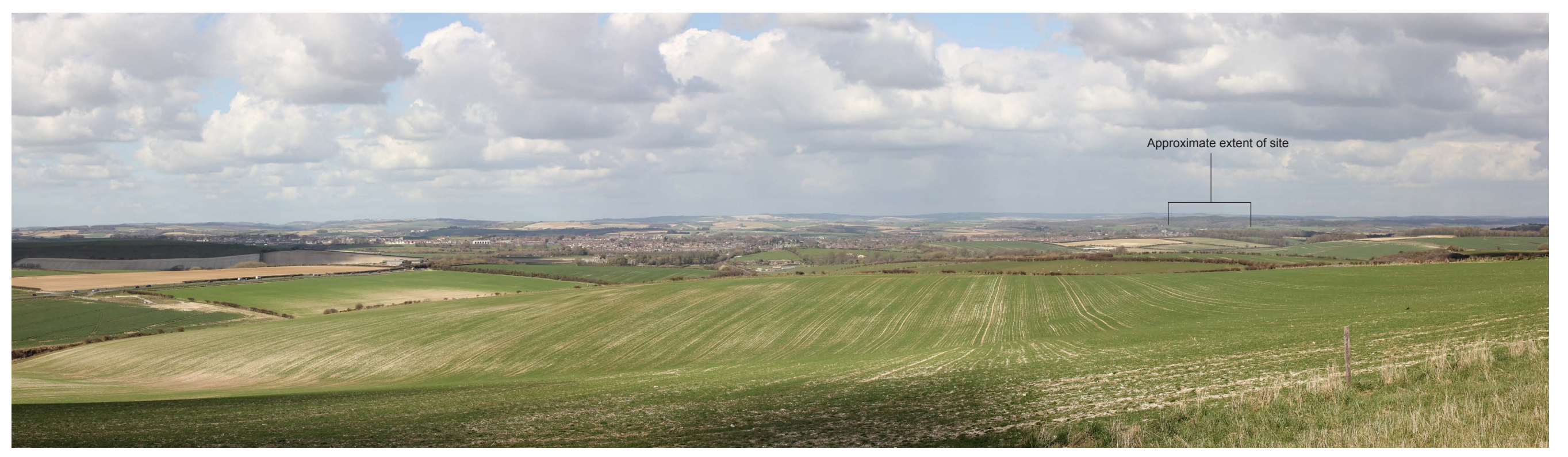
Photoviewpoint 15: View from the road to Bincombe Barn, looking north east.