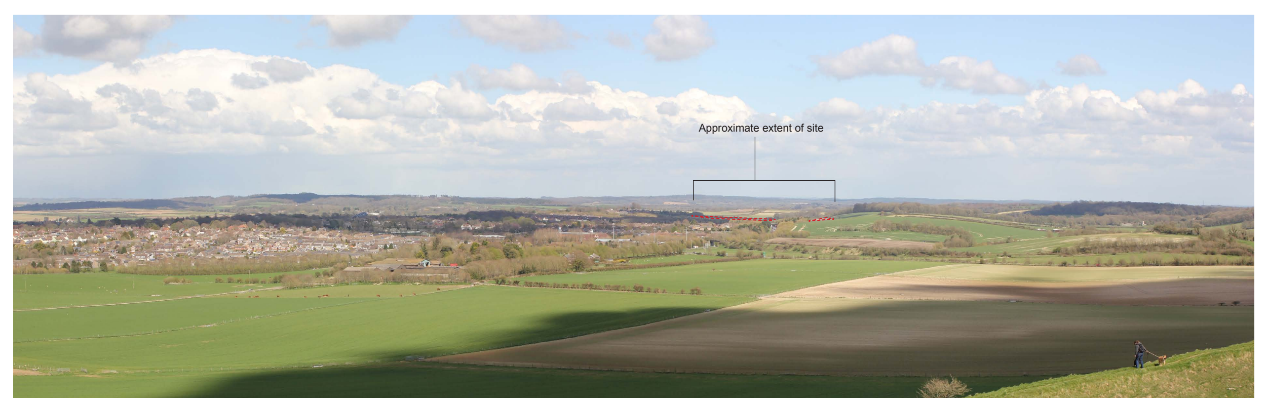
Photoviewpoint 10: View from Maiden Castle, looking north east