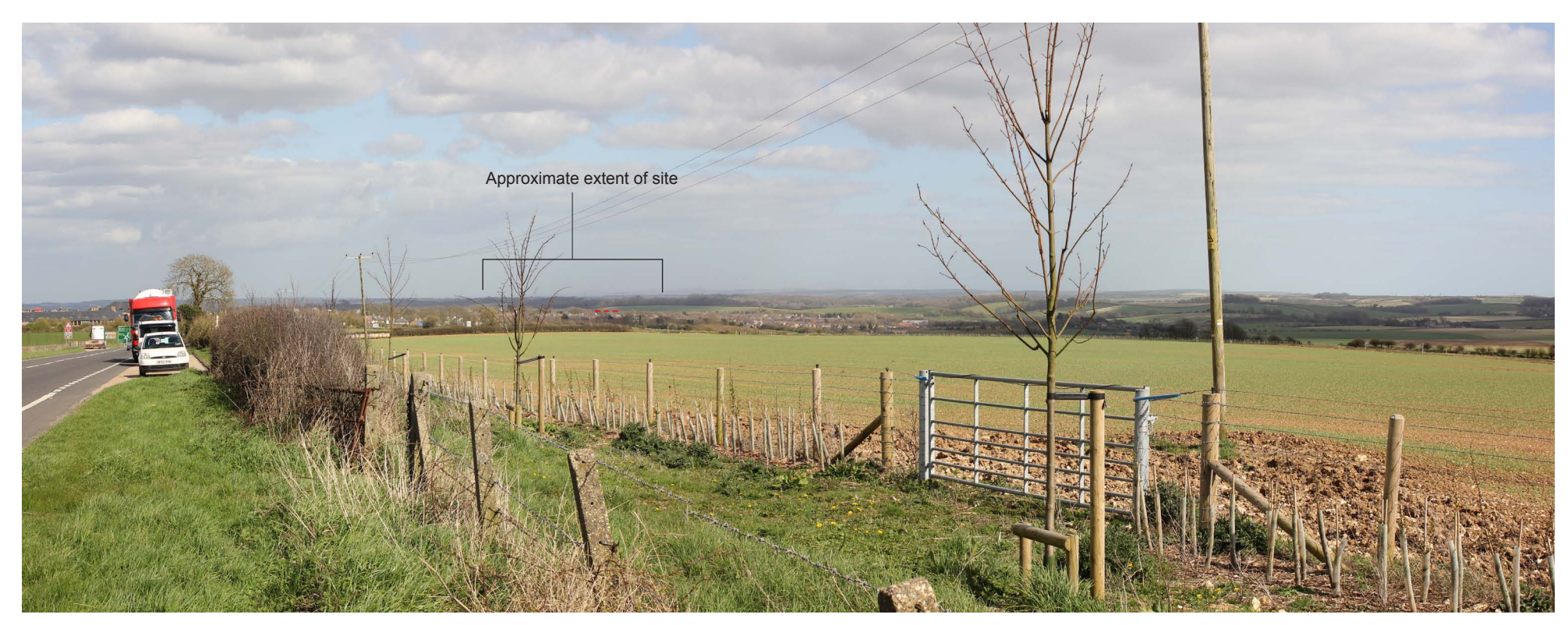
Photoviewpoint 12: View from the A35 to the west of Dorchester, looking east.