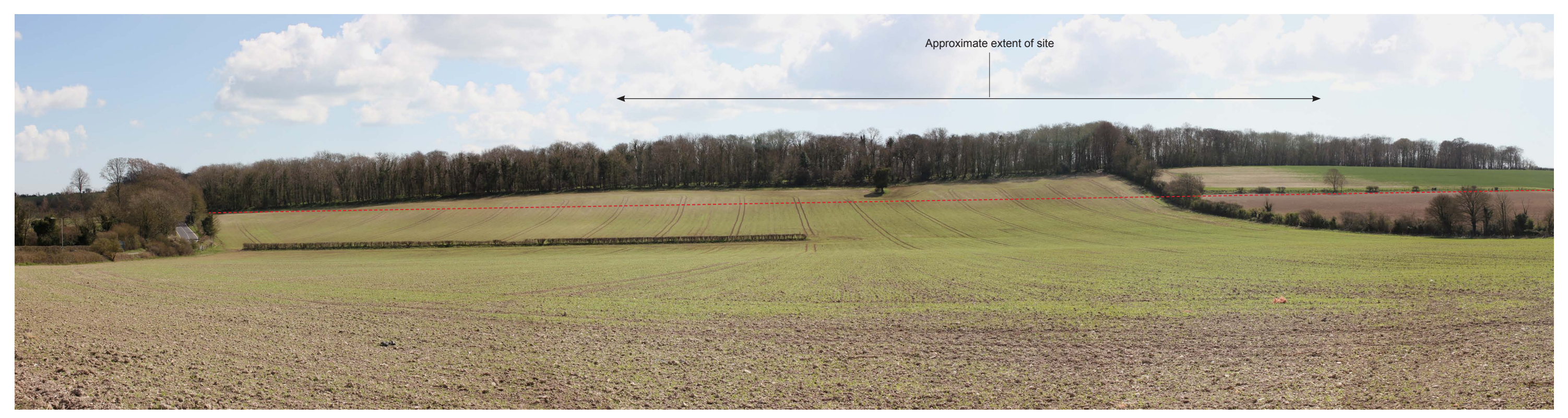
Photoviewpoint 1a: View from the A352 to the north east of site, looking south.