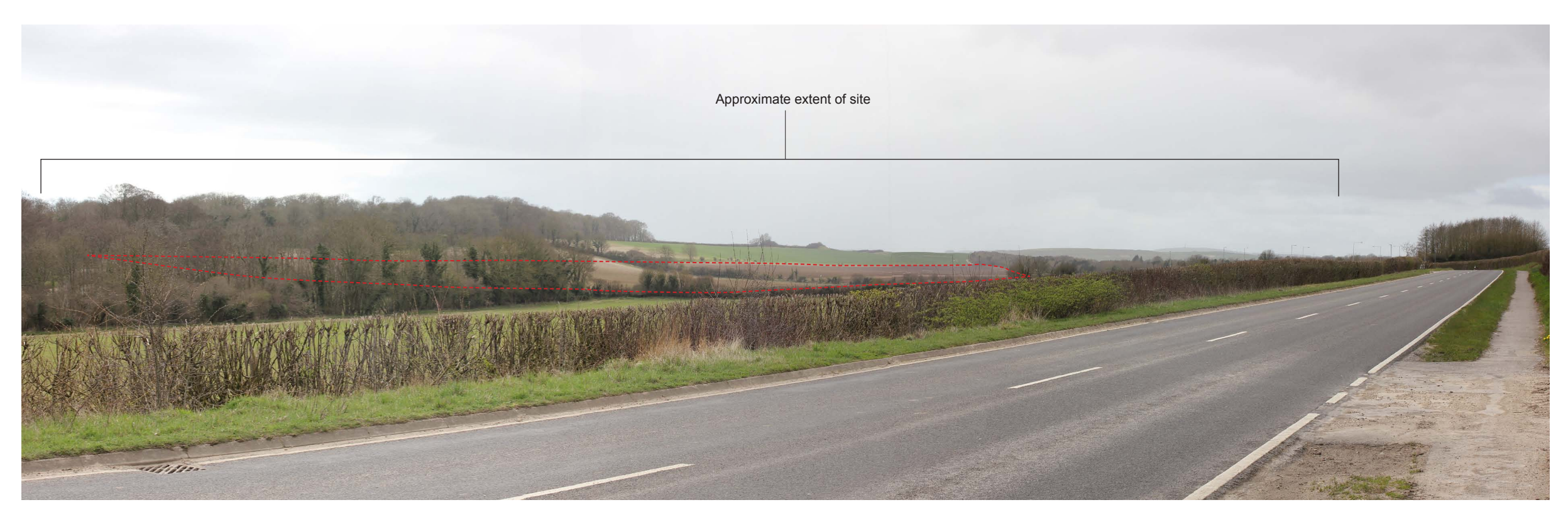
Photoviewpoint 9: View from West Stafford Road (and NCN2) to the east of the site, looking west.