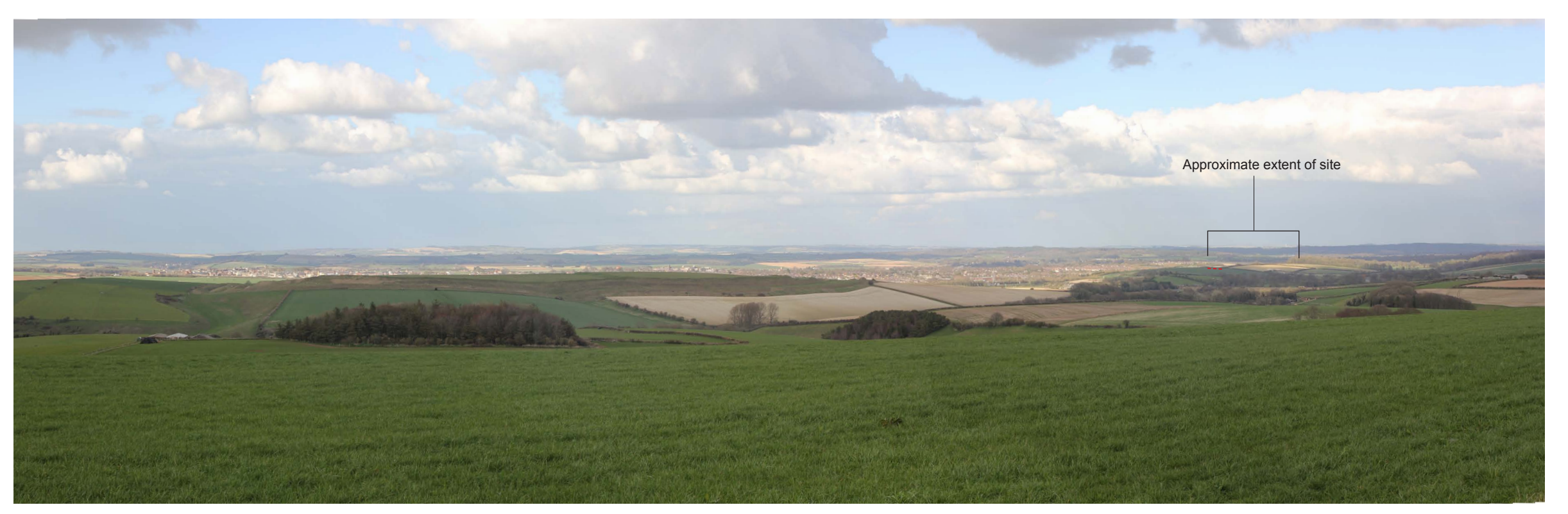
Photoviewpoint 16: View from the South Dorset Ridgeway (National Trail) to the east of Gould's Hill, looking north east.